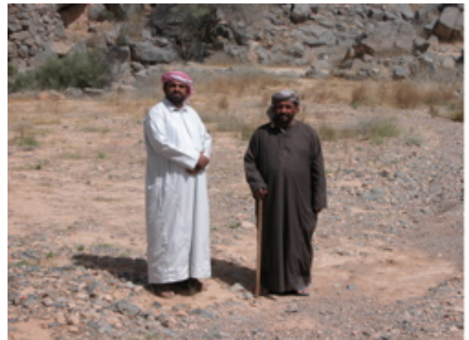
Our wild-almond harvesting visitors (or were they, in fact, our hosts?)

They ambled off to investigate the several wild almond trees around our campsite. One was carrying a traditional Shiloh walking stick with a small bronze axe on top, and afterwards it looked like he was using it to harvest wild almonds.