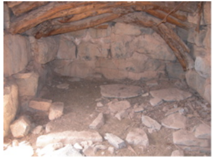
Inside an old house with an intact roof

Shortly before our departure, we had a visit by two local men who walked down from the road above our campsite. We exchanged greetings, and they said something about this being their "home", but that was about all our limited Arabic enabled us to pick up.