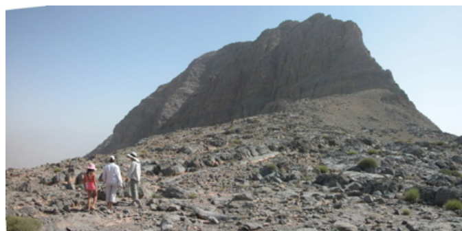
A scenic viewpoint up above our campsite

Following trip leader Andrew, we drove to RAK and thence up the Wadi Bih road, and through the Oman checkpoint to the summit, where we conferred with a local Emirati to confirm we were on the right track. Then we proceeded just over the other side to a cluster of old terraced agricultural fields. These flat, smooth, stonewalled surfaces made perfect camping areas, and there were enough of them for a group of our size to spread out and take our pick. With tents set up, the two youngest members of the group cooled down with a super-soaker water-gun fight. Then, as we had been led to believe would happen, Wadi Bih enjoyed a cool wind blowing that night, which made after-dinner conversation in shirtsleeves quite refreshing and sleeping very pleasant.