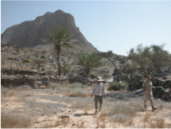
One of the terraced fields, with palm trees indicating ground water