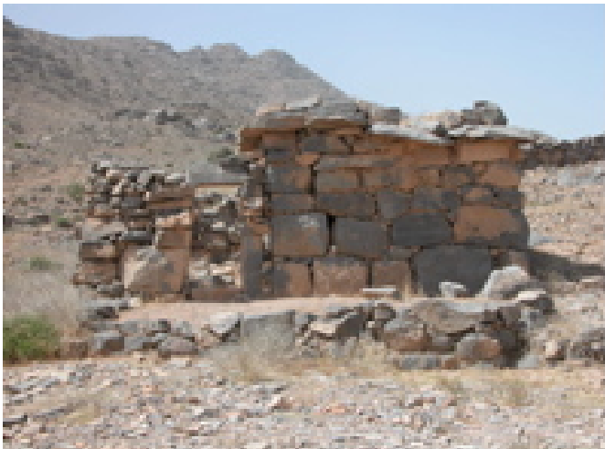
One of the abandoned old houses in Wadi Bih

The next morning we had a look around at the extensive network of terraces and the systems for channelling water via the adjoining wadis. It was here that the locals in centuries past grew wheat for the Julfar community on the coast, in nearby RAK many other things were grown, but humidity ruled out wheat production. Their harvested grain may have been carried down the mountain on the backs of donkeys, perhaps the distant ancestors of our nosey camp raiders. We also had a look at some old stone houses, one with even the timber roof still intact.