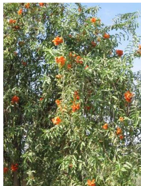
Tecomela alata

We drove on and stopped a little further on just after leaving the Al Ain road and turning toward Shwaib. In the middle of the road, various types of trees were growing, and there was a Tecomela alata with large orange flowers. It was a cultivated version of the native tree that grows in wadis.