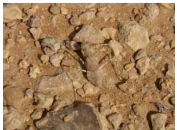
A ground mantis of the genus Eremiaphila , near the Jebel Buhays tombs, 14 Dec. 2007. These well camouflaged insects are related to the praying mantises.