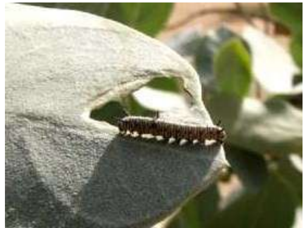
Plain Tiger Caterpillar, feeding on Calotropis procera , near Al Hayer, 14 Dec. 2007--unusual at this season.

All ENHG members are invited to submit documentation of observations of flora and fauna in the UAE, preferably with captions, including locality information and dates.