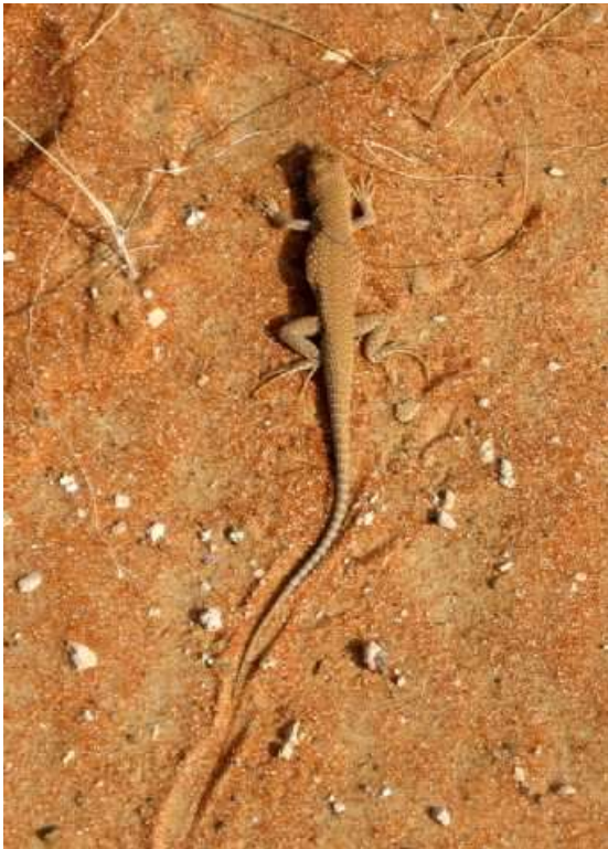
Schmidt's fringe-toed lizard Acanthodactylus schmidti , a typical lizard of sandy habitats throughout the UAE.

There were many date and vegetable gardens in the valleys off the sides of the road as we approached Al Hayer. Just before reaching there, we had our first natural history stop. It was amazing how much we could see between the road and the fence a short ways up a dune. There were tracks of many little critters such as lizards, scorpions, gerbils, and some kind of bird. We even saw a couple of white spotted lizards (Schmidt's fringe-toed Lizards) that were not particularly shy, so several of us got good photos.