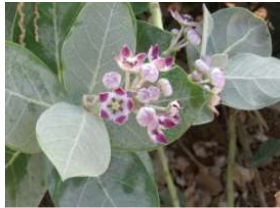
Sodom Apple, Calotropis procera

Allestree's handout listed a number of plants to look for. Some of the plants spotted at this first spot, with Allestree's assistance, were salt bushes, dark green clumps of Desert Broom ( Leptadenia ), low-lying Dipterygium glaucum , and some tall ghaf trees ( Prosopis cineraria ) across the road. The most obvious plant spotted here was a large Calotropis procera shrub in bloom, with attractive purple blossoms. Observed closely, this plant seemed to be a mainstay for local insect populations.