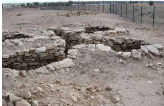
Excavated tombs at Jebel Buhays

We then drove part way around the mountain to see some tombs from the late 5 th and 4 th millennium BC, which is the oldest known occupation of the UAE. According to Allestree's handout, "Buhays is the most significant burial site in the country, as it represents continuous burials from the Late Neolithic down to the end of the Iron Age." Some tombs were behind a fence in order to protect them, so we had to take our photos from outside there.