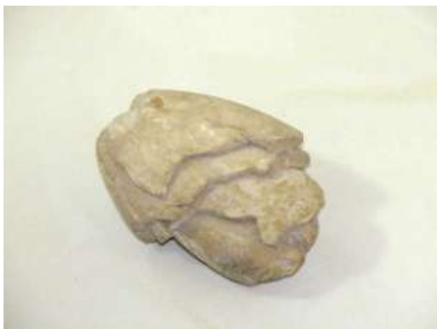
Gastropod Fossil

On the road again we drove through Al Madam and left the sand dunes behind. We soon reached Jebel Buhays via a short rocky road to our left. Some people found some very nice fossils of gastropods as well as intriguing pieces of flint rock, which looked just right for the construction of stone tools.