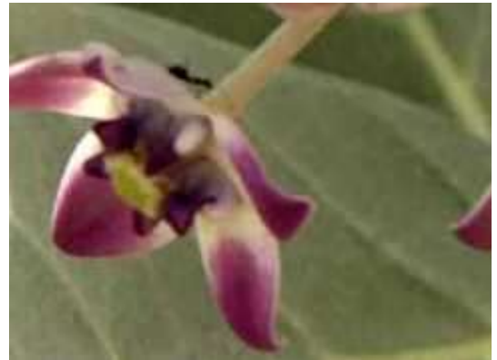
Ant feeding on Calotropis procera

We drove on and stopped a little further on just after leaving the Al Ain road and turning toward Shwaib. In the middle of the road, various types of trees were growing, and there was a Tecomela alata with large orange flowers. It was a cultivated version of the native tree that grows in wadis.