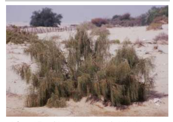
A Sauxal Tree (Haloxylon persicum), Al Wathba, 2007