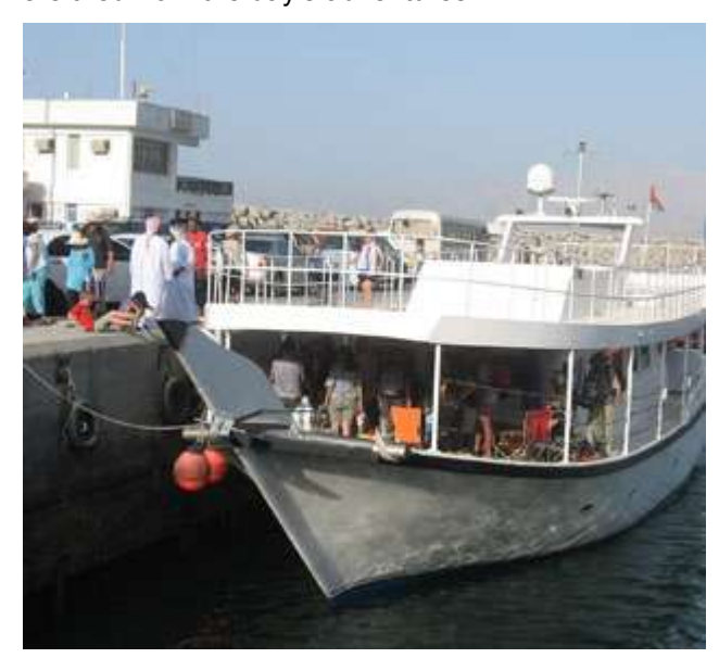
Getting off the yacht at low tide

We went further through the khor and snorkelled again. The water was shallower there, and there weren't as many varieties of fish or coral. But there were just as many spiny sea urchins to watch out for! Afterwards, we went directly back to the harbor in Khasab arriving about 4 p.m. It was a quieter evening in camp as most people were tired from the day's adventures.