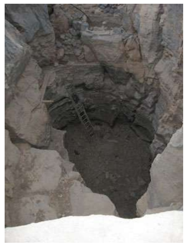
One of the wells

Back up and over the ridge we drove to an abandoned stone village on the top of another ridge. There were many rundown buildings, and it was hard to tell which ones might have been houses and which ones were used for storage, etc. There were three wells, one of which had water in it. There were also graves clearly visible a little way below the village.