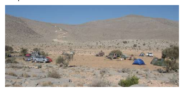
Our campsite on Jebel As Saye

We arrived in camp around 4:30 p.m. and were happy to find that the advance group had done a great job of securing a large area with plenty of space for everyone to put up their tents. Wild almond trees provided shade here and there, and most of us set up near one of those spots. As we were finishing up, Gillian Kirkwood came around with biodegradable garbage bags, so we filled them up with lots of plastic bottles and other trash, leaving our camp a cleaner place than we'd found it. Meanwhile the kids gathered firewood and had their own fire after dinner while the adults joined one of the group campfires.