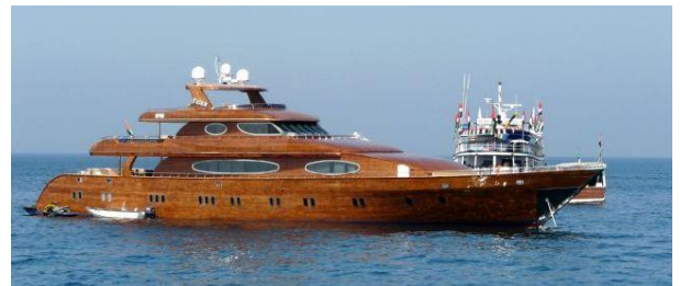
Custom-built teak yacht

Friday mid-day some of us spent time cooling off and snorkelling in the harbour, where lots of clownfish and some barracuda and red snapper were sighted amongst some large flat-topped corals. Some took walks round the island (See Liz’s write-up below, pp 4-5).