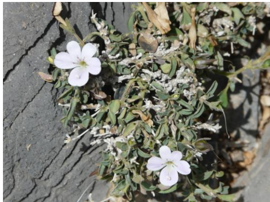
Barleria hochstetteri [Family Acanthaceae]