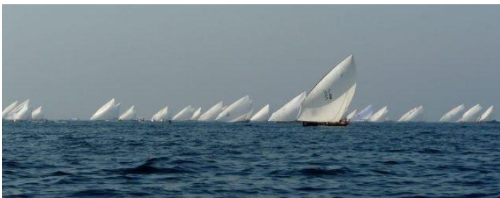
The race is on!