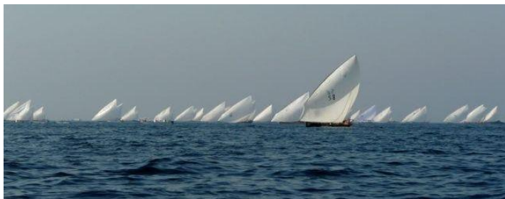
The race is on!