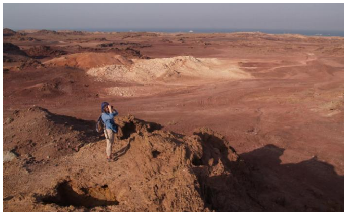
The author surrounded by multi-coloured rocks

were various multicoloured strata...it was very reminiscent of what I have seen in the various wadis around Buraimi and Hatta. I don't recall seeing any substantial trees...mainly low bushes, and none of the typical acacia species we usually see on the mainland.