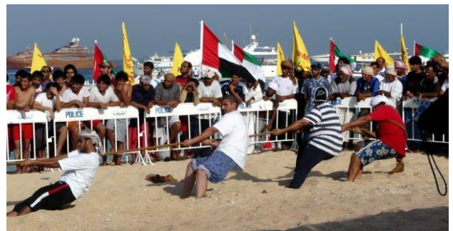
Beach tug-of war

Friday mid-day some of us spent time cooling off and snorkelling in the harbour, where lots of clownfish and some barracuda and red snapper were sighted amongst some large flat-topped corals. Some took walks round the island (See Liz’s write-up below, pp 4-5).