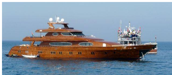
Custom-built teak yacht

Friday mid-day some of us spent time cooling off and snorkelling in the harbour, where lots of clownfish and some barracuda and red snapper were sighted amongst some large flat-topped corals. Some took walks round the island (See Liz’s write-up below, pp 4-5).