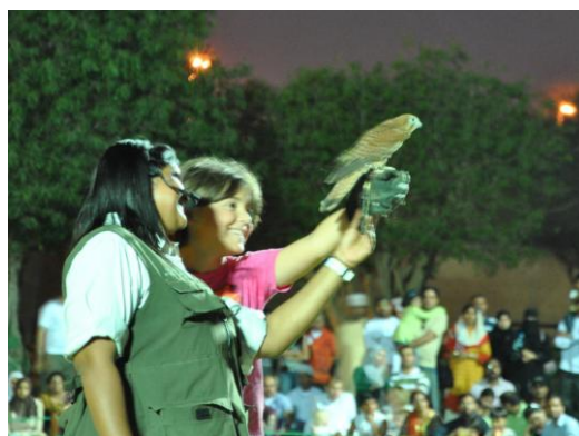
Presenter with Imogen and kestrel – stars of the show!

The night zoo still has some work to do to catch up with world-standard zoos like the San Diego or Singapore Zoos, but it is on its way. Return visits over the next few years to check out the developments are recommended. During the summer, till Sept. 30th, it is open till midnight, with last entry at 11 pm. Ramadan hours: till 2 am. For further information, see the website link on p 7.