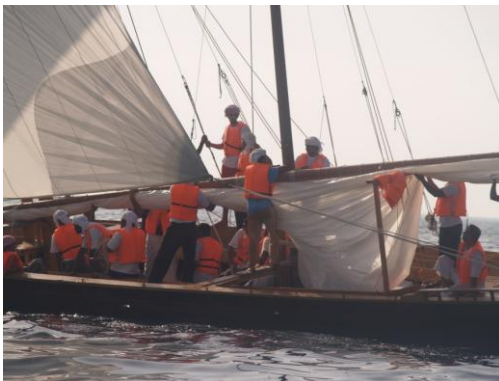
Hoisting the sails