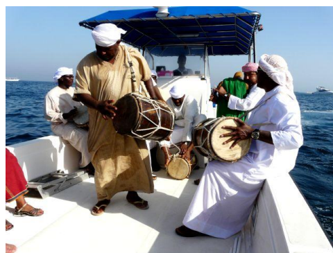
Drummers on a small ferry