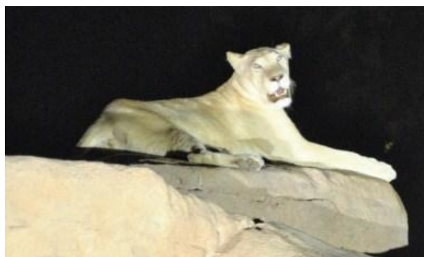
Female white lion at the Night Zoo