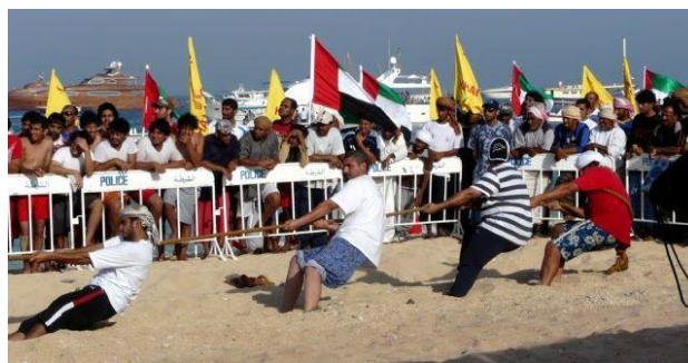
Beach tug-of war

Friday mid-day some of us spent time cooling off and snorkelling in the harbour, where lots of clownfish and some barracuda and red snapper were sighted amongst some large flat-topped corals. Some took walks round the island (See Liz’s write-up below, pp 4-5).