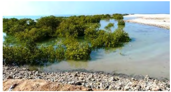
Delma island mangrove bay near our beach campsite

On Saturday morning, we broke camp fairly early, drove to the large airfield on the eastern side of the island, and hiked to the summit of the highest hill. The ground was covered with shiny mineral flakes and a lot of reddish iron ore, both hematite—which we'd seen samples of in the museum—as well as a greenish copper ore.