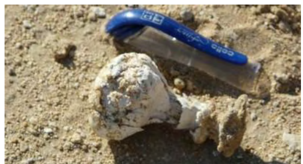
White puffball-type fungus, filled with red spores