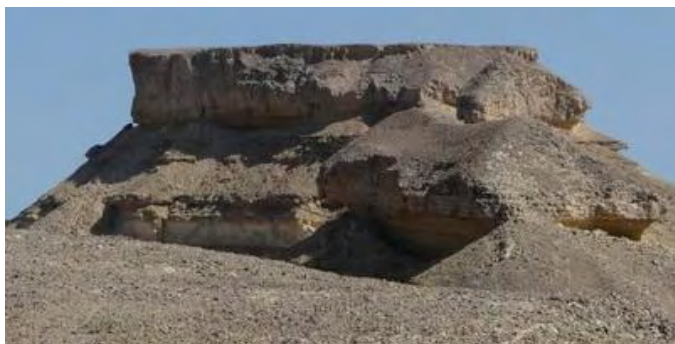
The central outcropping at the Ibri anticline

At this site, we found an amazing assortment of marine fossils, including bivalves, gastropods & corals. Living fauna included one Sinai Agama. Living flora consisted of several sp, including the 'Eyelash Plant'.