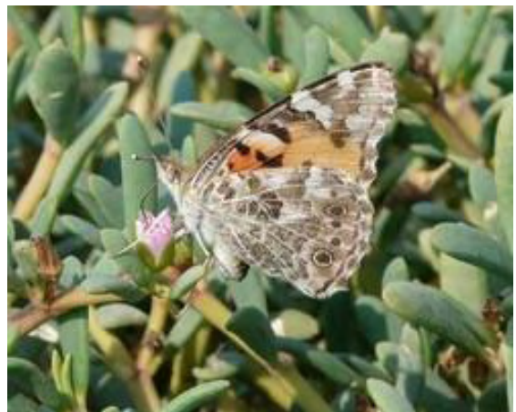
Painted Lady Vanessa cardui on Sesuvium verrucosum

Back on the beach, we swam, relaxed in the shade or spotted birds (see list below) and other wildlife while Feng cooked up a fish that she'd been given by a generous fisherman that morning and then shared it round. Finally, we headed back the main harbour to catch the 1 pm ferry to the mainland for the drive home.