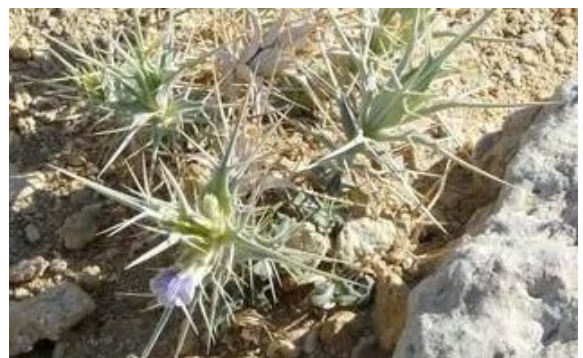
'Eyelash Plant' Blepharis ciliaris