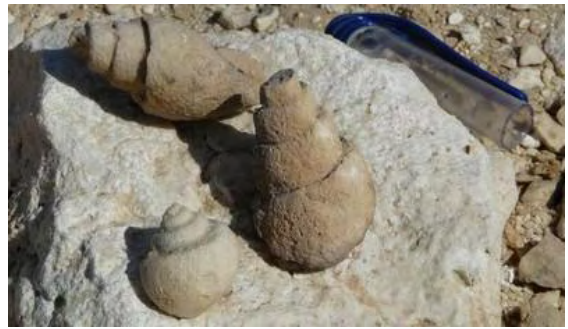
Gastropod fossils: 2 Cerithids and 1 Naticid