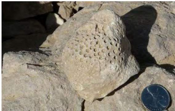
Colonial coral fossil