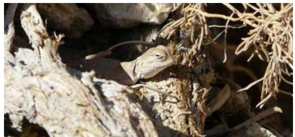
Sinai Agama in hiding place