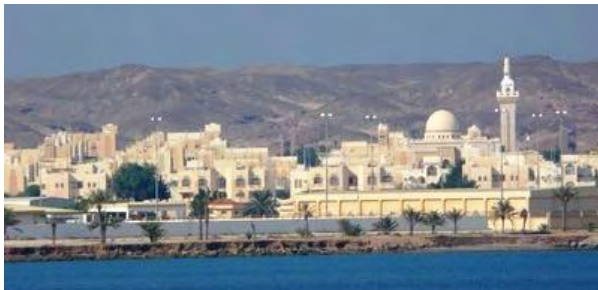
Approaching Delma town by ferry