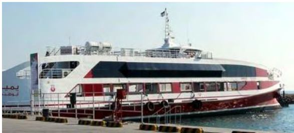
Delma Island ferry

On 10 th -11 th Dec, seventeen ENHG members from Abu Dhabi and one from Al Ain took a modern ferry from Jebel Dhanna for a weekend exploration of Delma Island. As we set off, some of us caught a glimpse of a few dolphins cruising the ferry slip and then preceding us out into the Gulf.