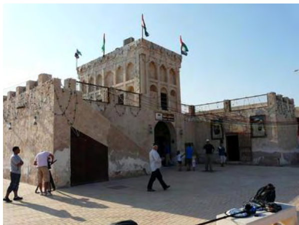
Delma museum - a former pearl merchant's house

On our arrival, we toured the old wooden dhow harbour and visited the quite informative museum, which detailed the historical importance of this island to the pearling industry. There we ran across a friendly Dubai-based