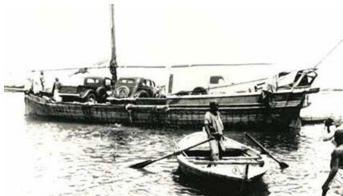
Geologists' cars on a dhow preparing to sail to western AD