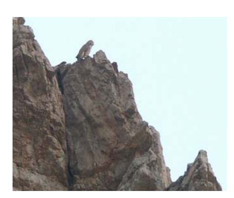
Bubo bubo desertorum

Great excitement on 18 May when, during a very early morning walk up Wadi Hafarah, we surprised three eagle owls (Bubo bubo desertorum). One flew closely over our heads and settled on a nearby ridge, resembling a 'sitting up' cat because of its ears, eyes and size.