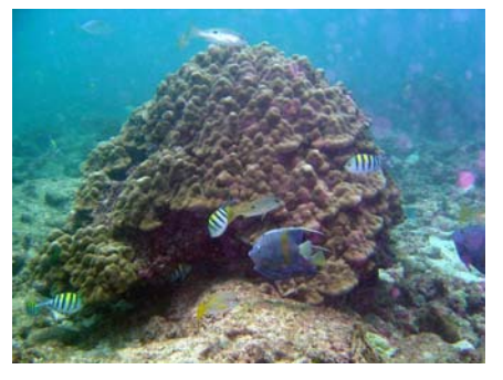
Coral heads and abundant fish

In addition we saw more two-bar bream than we have ever seen on the offshore wrecks or on the East Coast – our companion explaining that the Arabic name for the fish means 'Captain's daughter' because the black stripes on the fishes head resemble the burga.