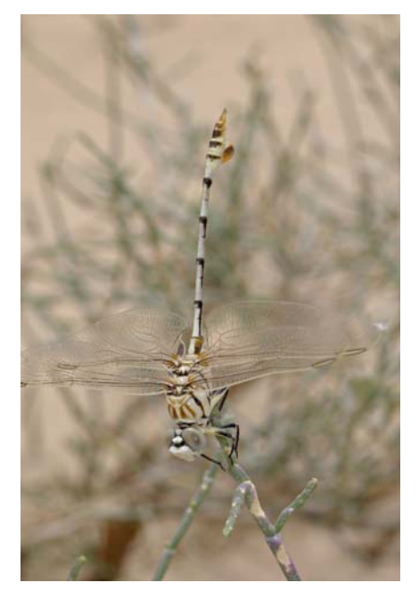
Lindenia tetraphylla

firsts for me: the barred warbler and spotted crake. Equally remarkable were good views of a monitor lizard ( Varanus griseus ), which we were able to monitor ourselves as it made a small circuit of the area and drank from the puddles. At another site in the damp center of a broad pan, I added three more species new to me: the black-winged and collared pratincoles and the whitewinged black tern.