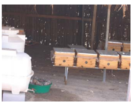
Barasti shelters Preparations for honey