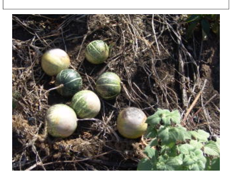
The gourds brought a nostalgic smile to my face with memories of similar clusters nestling in dune hollows.

E.mail your reports to pvana@emirates.net.ae, (Arial 10 justified) or deliver them to Anne Millen on floppy disk at monthly meetings.