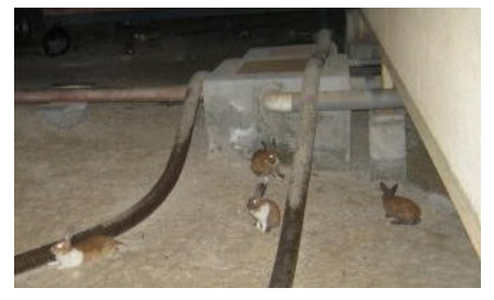
Nocturnal visitors - rabbits!

Dhubs were not the only examples of wild life, which we had the opportunity to see.