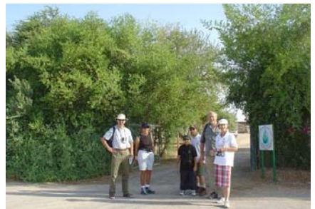
Some of the birding group at the entrance to the Pivot Fields

A group of about ten DNHG birders assembled at the Pivot fields early on a nice cool morning - such a relief after the heat of summer. . We didn't have to walk far to see hundreds of birds of many different species. Highlights were about a hundred chestnut bellied sandgrouse flying around, some of which eventually settled right in front of us allowing good views through Dave's telescope. This is a species which is becoming increasingly difficult to find as its coastal plain habitat is eaten away by development. A rare male pallid harrier was spotted perched on one of the pivot sprinkers and a single glossy ibis, several white tailed plovers, blue cheeked bee-eaters and collared ratincoles added quality to the day's birding. Around the perimeter track we added a few common birds such as the grey francolin to our list.