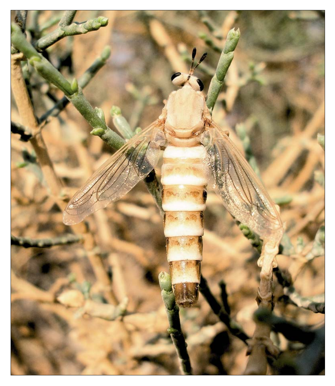
Plate 1. Eremomidas arabicus Bequaert, female, ad-Dhaid.

Diagnosis: E. arabicus is distinguished from other Eremomidas species by the overall white or light grey appearance (Plate 1), the sharply depressed vertex, the absence of long setae on thorax and abdomen, the vestigial proboscis, and M_{1+2} terminating in R_1 . To this day, it is the largest species of Mydidae found in the Arabian Peninsula, with females having a wing length of 17.5–18.2 mm.