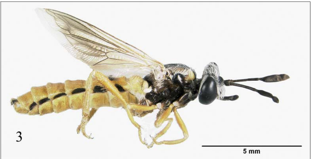
Plates 2–3. Rhopalia olivieri Macquart, S of Ra's al-Khaymah. 2: Female; 3: Male.

Remarks: The holotype of this species is deposited in the Muséum national d'Histoire naturelle (MNHN, Paris, France), but has not been studied. As mentioned above, the species identification is not entirely certain as there is no recent revision of this genus. In the key to species provided by Séguy (1941) it will run to Rhopalia olivieri , but Rhopalia oldroydi Lyneborg, 1970, which was described from central Afghanistan, does match the species in many details as well. Having studied specimens indistinguishable from the ones above