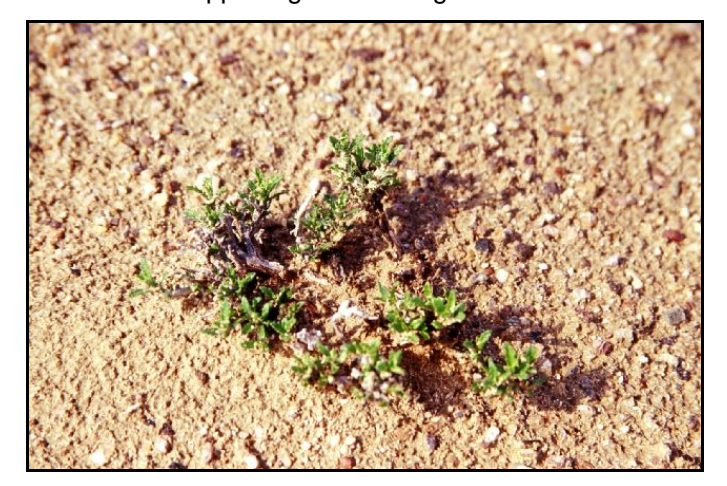
New growth on a Rhanterium bush

about 4 colonies in Abu Dhabi and Dubai emirates. It has a lot of Fagonia and Lycium shawii (Desert Thorn) growing among the acacia, and there are a number of different lizards and rodents living under the trees. We recently saw fungus there as well probably brought on in association with the gazelle droppings. It is prime terrain for conservation, being an area of low sand dunes and sand sheets supporting a wide range of wildlife.