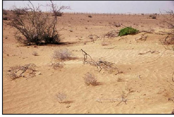
Saih Al Salam: Rhanterium in the sand

This area just east of the Abu Dhabi-Dubai route is well worth a detour if you are looking for desert landscapes still largely untouched by the developers. You need to turn off the main road at Saih Al Sidirah, and again for the Endurance Village. You will come out at Lissaili on the Dubai-Al Ain road.