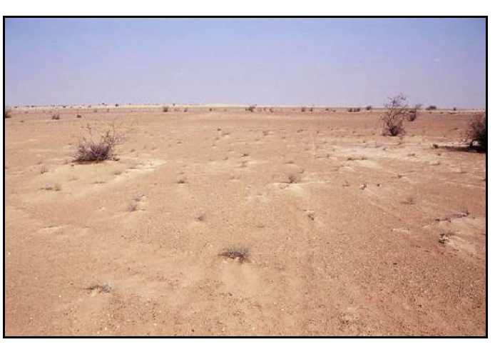
Saih Al Salam: Rhanterium & Acacia ehrenbergiana

The plant can currently be seen on the Jebel Ali-Lahbab road, atop Jebel Hafit (near the hotel) and on Saih Al Salam (pictured below).