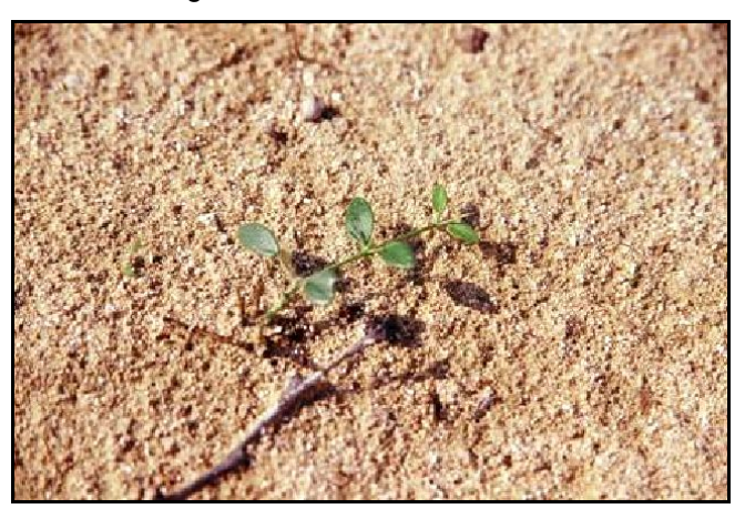
A young Fagonia plant

Also very common in the sand on this plain is another perennial: Fagonia. The rains have caused a lot of germination. If you look carefully at the leaf you can tell whether it is ovalifolia, indica or brughieri. The ones we have on this site are mostly Fagonia ovalifolia, associated with the coast, and are found even in the coastal waste ground in Abu Dhabi.