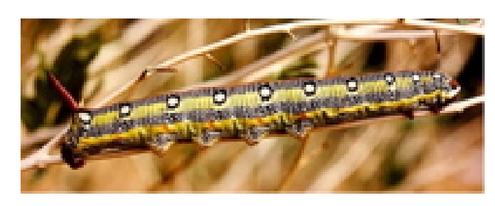
Hyles tythymali deserticola

The Taweelah caterpillars are also very similar to those of the Barbary Spurge Hawk moth Hyles tythymali deserticola , which is a very desert-adapted hawk moth that occurs across the northern Sahara, from Morocco to eastern Egypt. The adults are said to fly by day in the hottest time of the year. The habitat of this species is said to be desert steppe and stabilized sand dunes, which certainly fits with that at Taweelah. The pupae are said to be in diapause for several seasons and may be triggered to emerge by heavy rain.