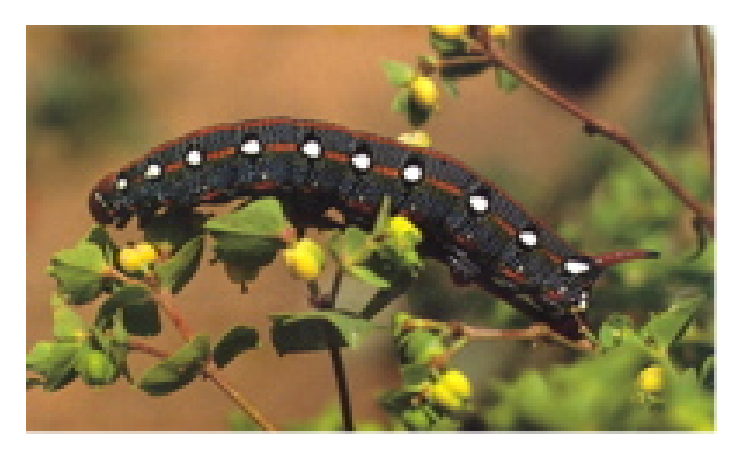
Hyles tythymali hymyarensis

similarities with those at Taweelah, but they are clearly not the same.