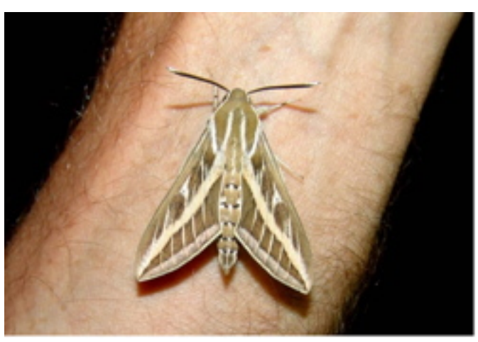
Dick Hornby February 2007

This is clearly an adaptation with considerable selective advantage. Adults all emerge at about the same time after rain, thus facilitating mating. The eggs that are laid following those matings then become caterpillars that are able to take advantage of the flush of plant growth that follows the heavy rain. The present generation of caterpillars at Taweelah, are likely to produce many pupae which will remain in the sand until the bulldozers move in to create the new Khalifa Port Industrial City. Perhaps we should press for a mass translocation of pupae! Wouldn't it be a tragedy to lose several years worth of these beautiful creatures: