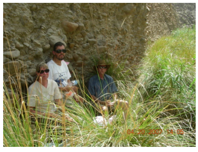
Lunch in the only shade we could find