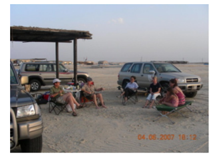
Beach gazebo campsite; EMEG buildings in the background

Snorkelers found the waters too full of sediment to see much, but we were told that some still quite viable coral reefs exist 100 metres or so offshore. Perhaps on another visit we can get a boat ride out to the reef to try the snorkeling there, in the hope that it is not too badly interfered with by the Dubai Waterfront development. Beachcombers who ventured down to the right towards that development discovered large chunks of washed-up coral, bearing witness to the destruction that project is causing, as the waters are muddied by the dredging, and the corals are dying and washing up. We hope that Major Ali's goal of making his part of the reefs into a protected area can be accomplished realistically, with all the environmental degradation of the massive development project going on next door.