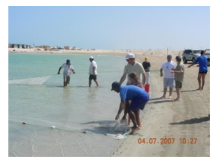
Anchoring the near side as the far side is hauled in