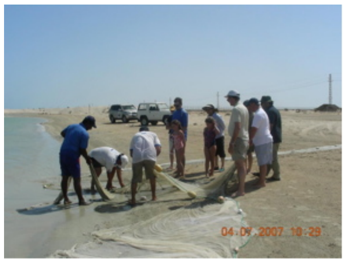
Examining the catch