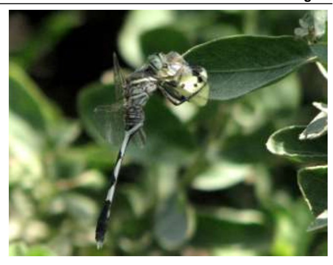
A dragonfly Orthetrum sabina (the 'Slender Skimmer') eating a Blue-spotted Arab, near Dubai, 6 Oct. 2007.