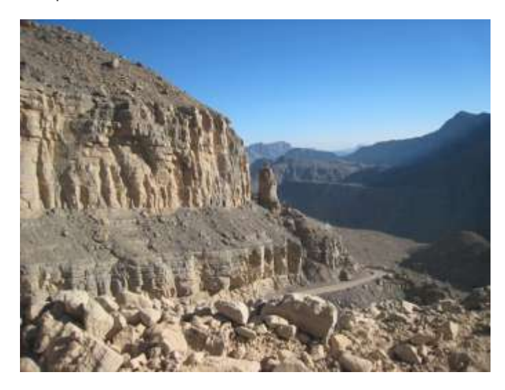
The Magnificent Musandam

Once we had completed the border formalities, we headed up the coast a short way to have lunch on a beach in the shelter of an empty boat shed normally inhabited by goats. After lunch we headed through Khasab and then into the mountains along a steep and winding road through magnificent scenery to our campsite.