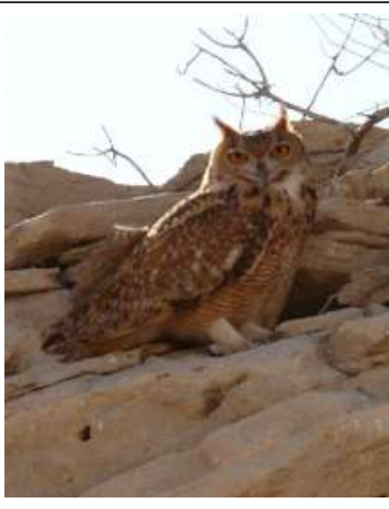
Desert Eagle Owl (now re-named the Pharaoh Eagle-owl, Bubo ascalaphus desertorum ) photographed near Jebel Ali, 19 October 2007