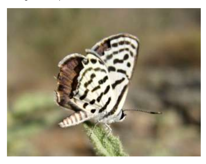
A Mediterranean Pierrot with badly damaged wings, probably due to bird damage, 18 Nov. 2007.