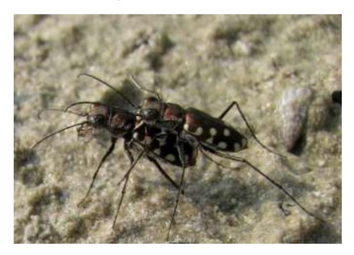
This mating pair of tiger beetles Calomera littoralis was observed in mangroves near Yas Island, 25 Oct. 2007.