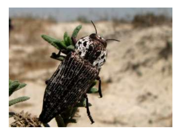
This jewel beetle Capnodis excisa was sighted near Nad al Sheba in Dubai, 3 Oct. 2007.

The two beetle species below have both been confirmed as new records for the UAE: