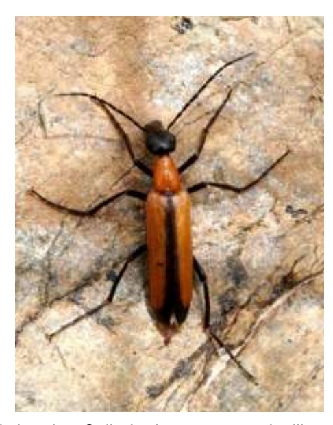
An oil beetle Cylindrothorax angusticollis suturellus , photographed at 'Village One' near Khutwa during the 2007 Inter Emirates Weekend.