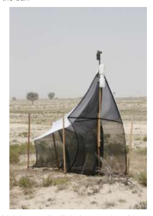
Malaise trap for flight interception of insects