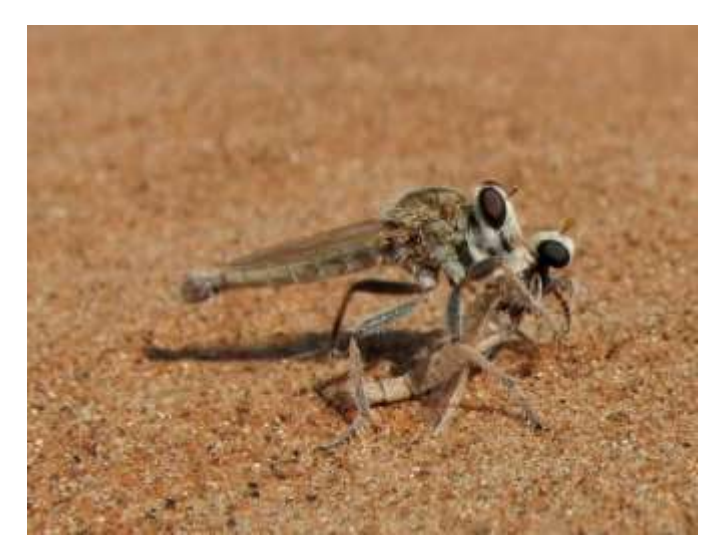
This Robber Fly, of a species commonly observed in the UAE, is eating another one, apparently of the same species--a female eating a male, perhaps, after mating? Talk about an efficient use of resources! 5 Nov. 2007