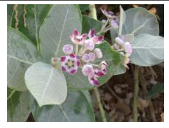
Sodom Apple, Calotropis procera

Allestree's handout listed a number of plants to look for. Some of the plants spotted at this first spot, with Allestree's assistance, were salt bushes, dark green clumps of Desert Broom ( Leptadenia ), low-lying Dipterygium glaucum , and some tall ghaf trees ( Prosopis cineraria ) across the road. The most obvious plant spotted here was a large Calotropis procera shrub in bloom, with attractive purple blossoms. Observed closely, this plant seemed to be a mainstay for local insect populations.