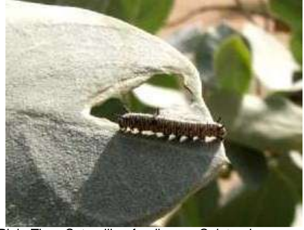
Plain Tiger Caterpillar, feeding on Calotropis procera, near Al Hayer, 14 Dec. 2007--unusual at this season.

All ENHG members are invited to submit documentation of observations of flora and fauna in the UAE, preferably with captions, including locality information and dates.