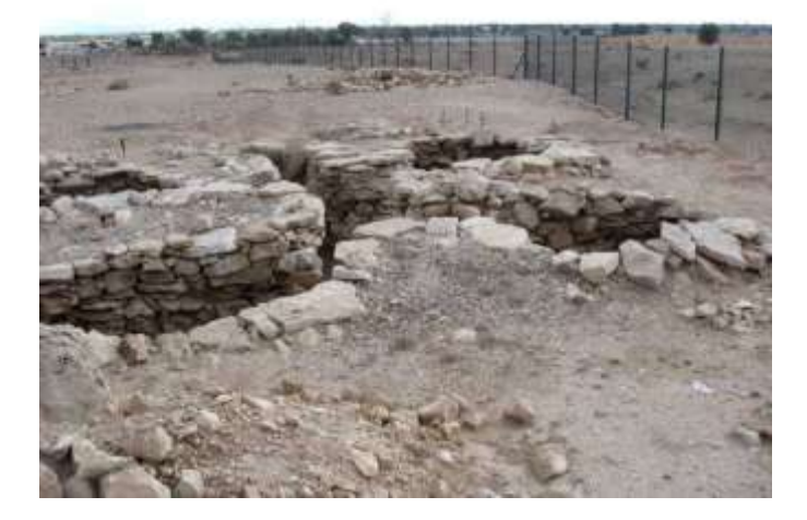
Excavated tombs at Jebel Buhays

We then drove part way around the mountain to see some tombs from the late 5<sup>th</sup> and 4<sup>th</sup> millennium BC, which is the oldest know occupation of the UAE. According to Allestree's handout, "Buhays is the most significant burial site in the country, as it represents continuous burials from the Late Neolithic down to the end of the Iron Age." Some tombs were behind a fence in order to protect them, so we had to take our photos from outside there.