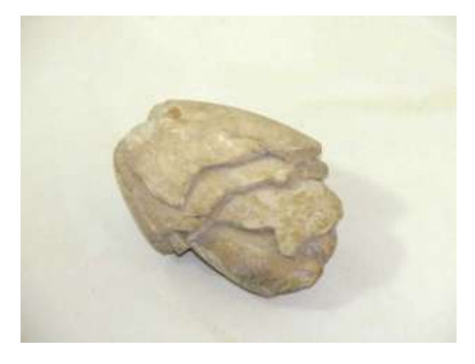
Gastropod Fossil

On the road again we drove through Al Madam and left the sand dunes behind. We soon reached Jebel Buhays via a short rocky road to our left. Some people found some very nice fossils of gastropods as well as intriguing pieces of flint rock, which looked just right for the construction of stone tools.