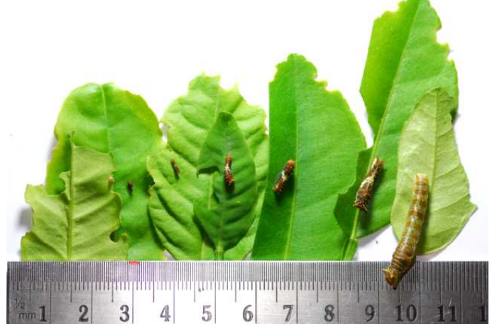
20 Dec. 2007: Showing egg, bird-dirt, & just-turninggreen stages of growth of the lime butterfly caterpillar.

The specimens of Papilio demoleus displayed here were collected in Abu Dhabi in 2 locations: on a tiny tree in the Karama St. area in Nov. and on several trees near the Intercontinental Hotel roundabout in Dec. 2007.