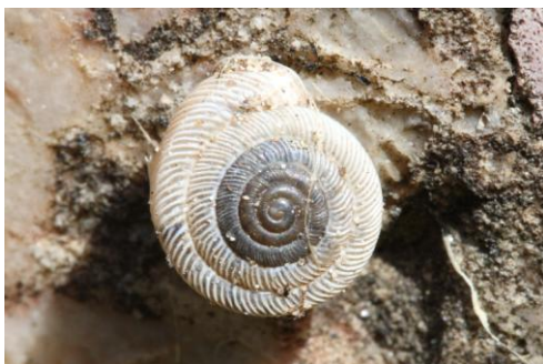
Southern Flatcoil Polygyra cereolus

The snails turn out to be the Southern Flatcoil Polygyra cereolus (Mühlfeld, 1816) in the family Polygyridae. This is an alien species in the UAE, being native to Florida. It has also been recorded in Qatar and Saudi Arabia as well as Hawaii. It was probably introduced here in imported soil and grass. This species has a flattened shell with a low conical spire. The surface of the coils is covered with regularly spaced ribs. Its clustered distribution has been noted elsewhere, where hundreds or thousands of snails may congregate on small sections of walls, while other areas are devoid of snails.