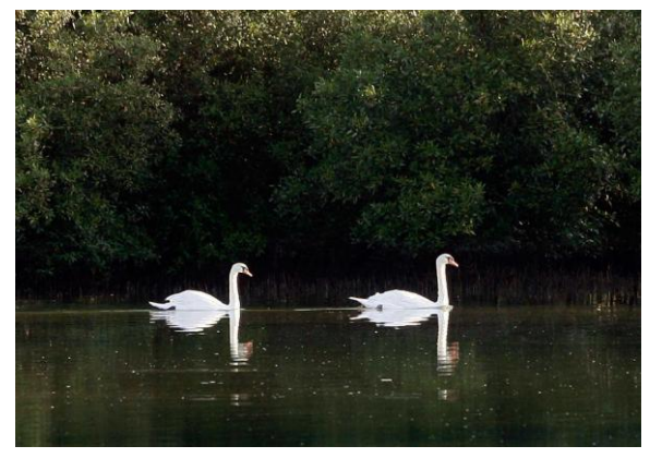
Mute Swans (most likely palace residents)

Eastern Corniche mangroves and palm grove:Western Reef Heron (white & dark plumage)Grey HeronGreater FlamingoMute SwanCollared DovePurple Sunbird – M eclipse colouration