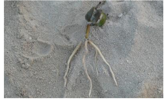
Viviparous Avicennia marina seedling

On the bend of a dredge-widened channel, Don pointed out a large stand of completely dead mangrove trees that had been cut off from the tidal flow by a large mound of dredged earth—demonstrating the fragility of this ecosystem, but we also saw signs of new growth: viviparous mangrove seedlings waiting to take root.