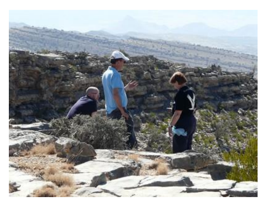
The vista from our campsite

Our high-altitude campsite was cold at night – probably down to a low of 5°C – making the evening campfire most welcome. The first night we took a quick peek through the club's telescope and saw Jupiter and three moons. On the fourth evening, there were scattered raindrops at the campsite. We had a regular evening visitor to the tents – a scavenging Egyptian Spiny Mouse. After most of the group left, an Arabian Red Fox also came round. The predominate flora: būt trees, Monotheca buxifolia (too late for berries) 'Hopbush', Dodonaea viscosa and wild Olive, Olea europea. Black & white Hume's Wheatears were the most obvious birds.