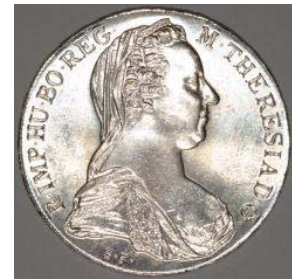
"JD" White coin

Many of our local museums and hotel shops include collections of jewelry, especially the heavy silver necklaces which often have coins attached. We saw some on our 'after hours' visit to the Al Ain museum visit. These coins are almost always the big 'Maria Theresa' silver dollars , which have an intriguing history of their own.