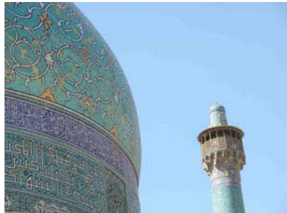
The Imam Ali mosque in Esfahan

The Lonely Planet describes the ancient city of Esfahan as "Iran's Masterpiece, the Jewel of Ancient Persia and one of the finest cities in the Islamic world" and for once, they were not exaggerating. I recently visited Esfahan and there is no better place to feel the peace and tranquility of Islam than in the Imam Mosque that finds itself in the Imam Khomeini Square. For avid photographers or anyone wanting to rest in silence, this Mosque contains a myriad of light, shadows, echoes, and color in the complete silence of the prayer areas, sheltered from wind and all outside noise. The mosque domes, walls, archways, ceilings and passageways are a brilliant array of blues and yellows on highly stylized calligraphy ceramic tiles. The inside ceilings are the same designs found on Persian carpets and all one can think is "how did they do that - it's so high up?", a question even more perplexing considering the fact that the Mosque only took 18 years to build. Once the capital of Iran, the Shah (meaning King) Abbas I