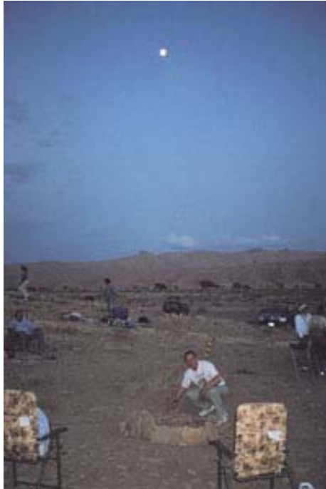
Setting up the firepit in the moonlight

This annual event is one of the best community activities the ENHG undertakes. About 5:00 pm on Friday evening people began gathering in the empty lot in front of the Buraimi Hotel. We headed out in our various vehicles, 4x4's and sedan cars, towards Fossil Valley and the Hanging Gardens on the Mahda road. Shortly after passing the turn off to the Hanging Gardens a dirt track led off to the right and we followed it to a lovely location behind a couple of low hills. Small groups climbed the low hill, watched the sun set and the moon rise.