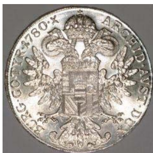
"JD" White coin

Over the years, they were used not only for legitimate trade, but also for bribery of local rulers. The Italians acquired the original dies from an unwilling but cowed Austria during the 1930s, and minted more thalers to finance their Abyssinian war. Undeterred, Britain's mint produced another 14 million during the 1939-1945 War, for undisclosed purposes!