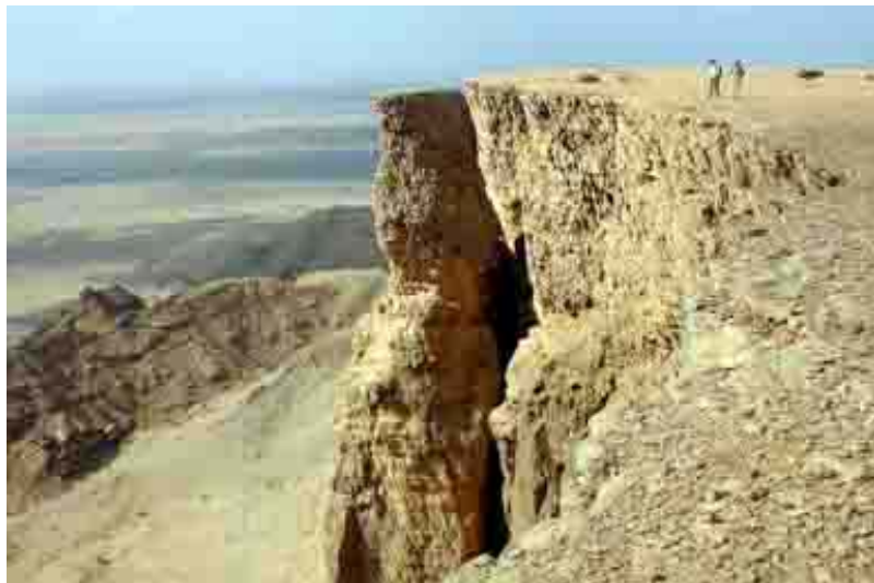
The views are fantastic

It was such a beautiful day, cool and partly cloudy that we decided to walk to the end of the plateau from where we sat and looked south into Oman. Then it was time for the return journey. Not wishing to retrace our steps, as we had done some "interesting" scrambling on the way up, we had no choice but to go down into a wadi and up the other side walk along a little way then do it again and again and again as we traversed the many wadis that carve up the plateau. Some of the group began to feel tired but they remained in good spirits and we kept moving at a reason-able pace. To save time and distance we decided to descend from the