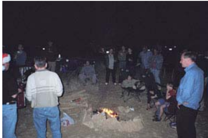
Cooking, gazing, eating, talking, singing, playing...