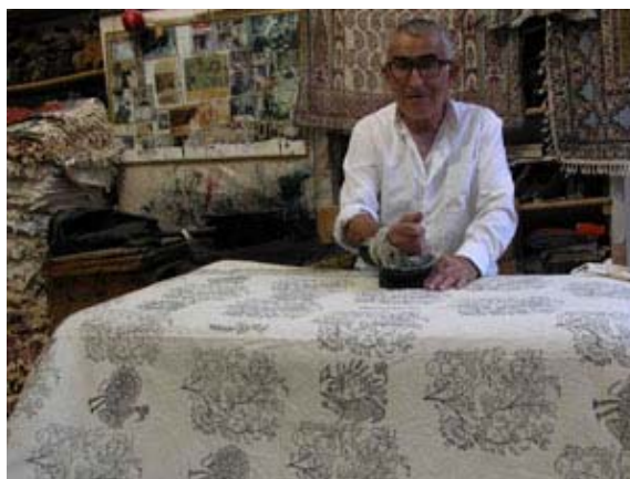
Tapestries such as this one are important Iranian products.

The people, the land, both the wonder and the ordinariness of Iranian humanity, are not to be missed. Intellectually stimulating, it's like looking in a fishbowl, at the results of an experiment that in many ways have worked and in other ways, reflect the many tangents and permutations that nations and people take and create to survive and live. A lesson, as all holidays are, in self-reflection and making sense of ourselves through the experience of others