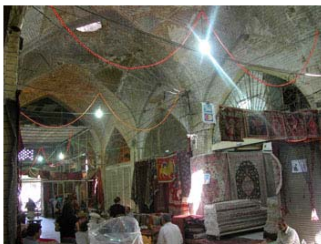
One of Tehran's souqs (bazaars)

Women should not at all be worried about traveling in Iran. The same rules apply as they do in the Gulf, a lone woman will always be served first and attended to with the utmost respect and efficiency. As long as your hair is covered and you have the appropriate clothing, and the no-touch rule is respected between genders, you can expect your stay to be like anywhere else.