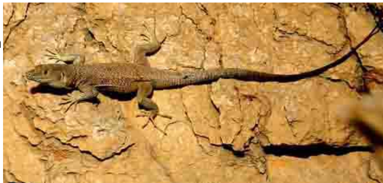
An Omani lizard ( Lacerta jayakari ) basking in the sun.

We continued up and around the back of the plateau at a leisurely pace. As we walked into the wadi leading onto the plateau we spotted an Omani lizard ( Lacerta jayakari ) basking in the sun. It was about 30 centimetres long and stayed around just long enough to have its photo taken. Further in there were pools of "fresh" looking water. Interestingly there were no signs of mosquito larvae only very active water beetles. After a short stop for refreshments at the look-out point I showed the group the fox den on the ledge below.