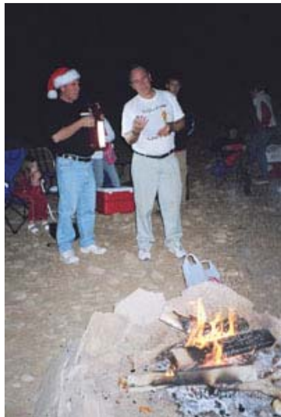
The reading of Khalil Gibran's poetry