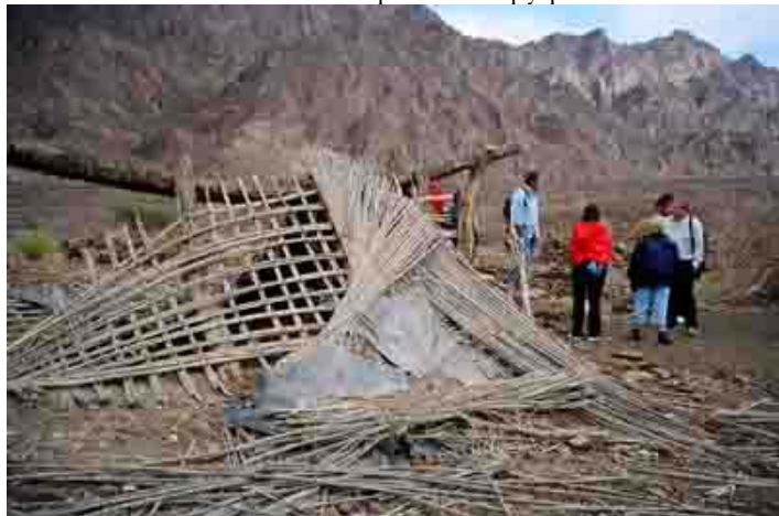
The khaima style roof used widely throughout the UAE up until quite recently. This site was abandoned no more than 25 years ago, and possibly less.

And finally, but not leastly - on December 30th a group sallied forth to a location just outside of Ray/Fay on the Hatta road. The village offered the khaima type rock house with the roof still in place (though sagging somewhat). We were able to appreciate how these structures served their inhabitants, providing shade, ventilation, security, privacy and all the necessities of domesticity. Phil Iddison, a life member, was in Al Ain for just a couple of days and provided us with an excuse for one last outing. Buildings were measured, GPS locations were taken. The information will be written up and a copy provided for the ENHG.