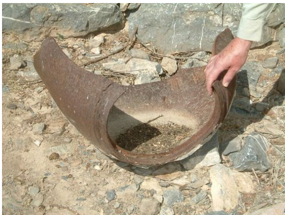
(Figure 3 A fragment of a 1000 pound bomb that we found on the Saiq plateau )

In June 1957 Talib came back with a Saudi-trained army, and joined brother Ghalib and friend Suleiman. Soon the area of Nizwa, including Jebel Akhdar, was in "rebel" hands. The Sultan asked for British help. They agreed: after all, they had an airfield at Masirah, and there was oil in the offing. They sent Shackleton bombers (Figure 2) from Aden, Bahrain, Masirah and Sharjah to drop 1000 pound bombs, in fact 1450 tons of bombs in 429 sorties. The pieces still litter the Jebel (Figure 3)