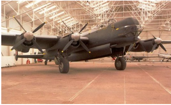
(Figure 1 A Lincoln bomber )