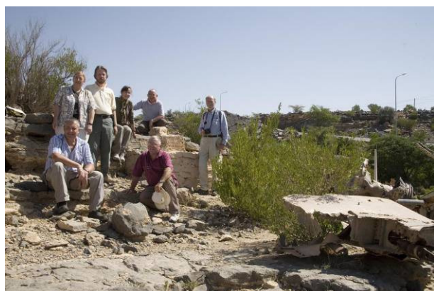
(Figure 7 Our visit on 30 August 2008, 50 years after the crash )