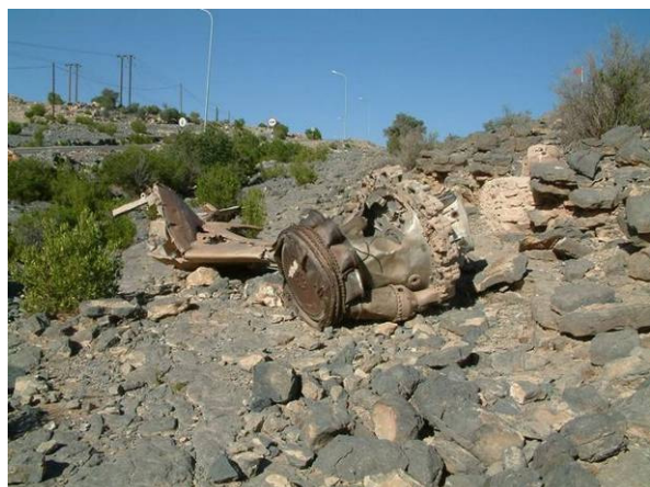
(Figure 5 Owen's Venom still lies where it crashed )

Parts of the wreck are still there (Figure 5) and alongside is a stone wall marking the grave of Owen Watkinson, who was buried under a cairn of rocks a little higher up the steep slope above the wreck immediately after the crash by local people, and later re-interred in the ledge behind the wall (Figure 6).