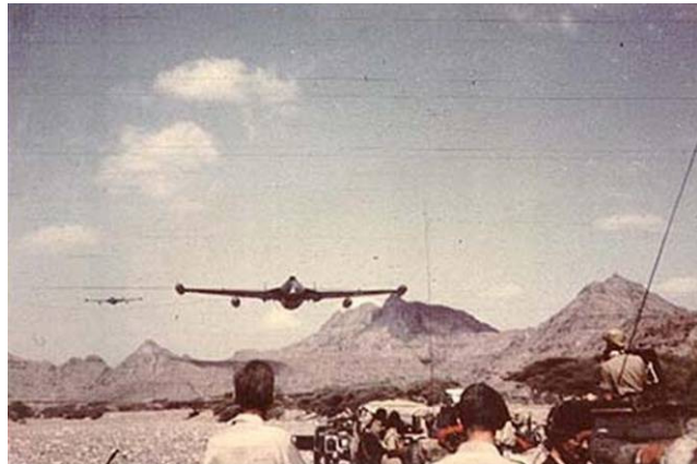
(Figure 4 Venoms fly low over the desert )

Next, Venom fighter-bombers (Figure 4) from Sharjah attacked Nizwa, but did little damage to the fort, nor indeed to the "rebels' " caves in the hills.