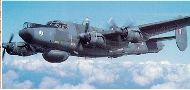
(Figure 2 A Shackleton bomber )