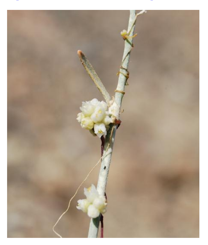
Cuscuta planiflora at work

A great website for more information about Cuscuta is http://www.main.nc.us/naturenotebook/plants/dodder.html