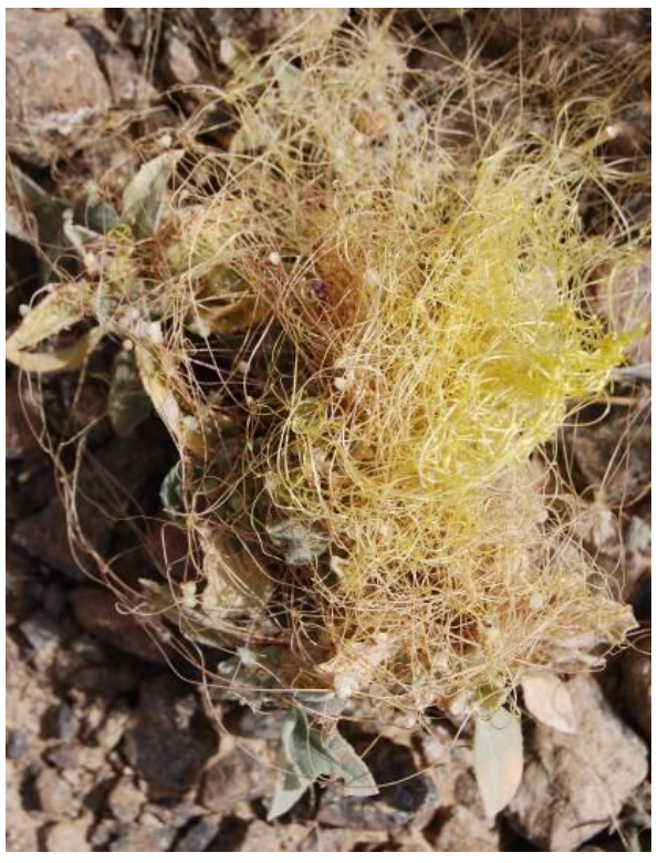
Close up of C.planiflora

1 See Marijcke Jongbloed. 2003. Wildflowers of the UAE p318.