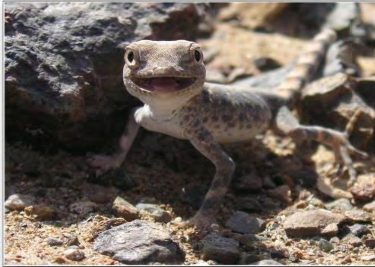
Smile ...! (First record of Pristurus carteri in the UAE)