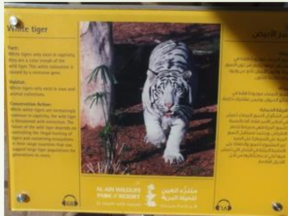
White Tiger Placard Al Ain Zoo