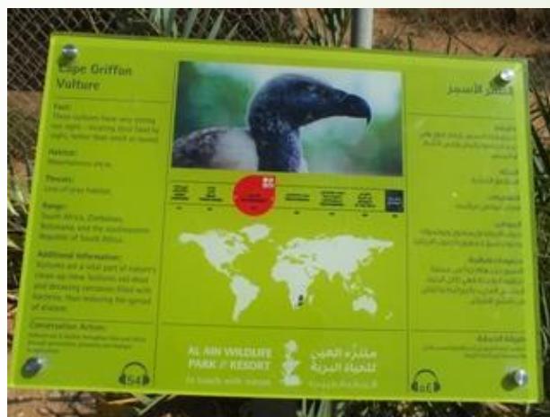
Cape Griffon Vulture Placard Al Ain Zoo