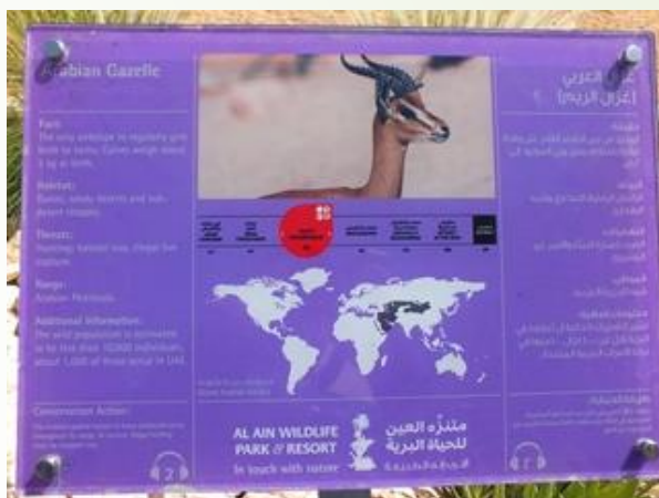
Arabian Gazelle Placard Al Ain Zoo