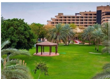
Danat Resort Hotel