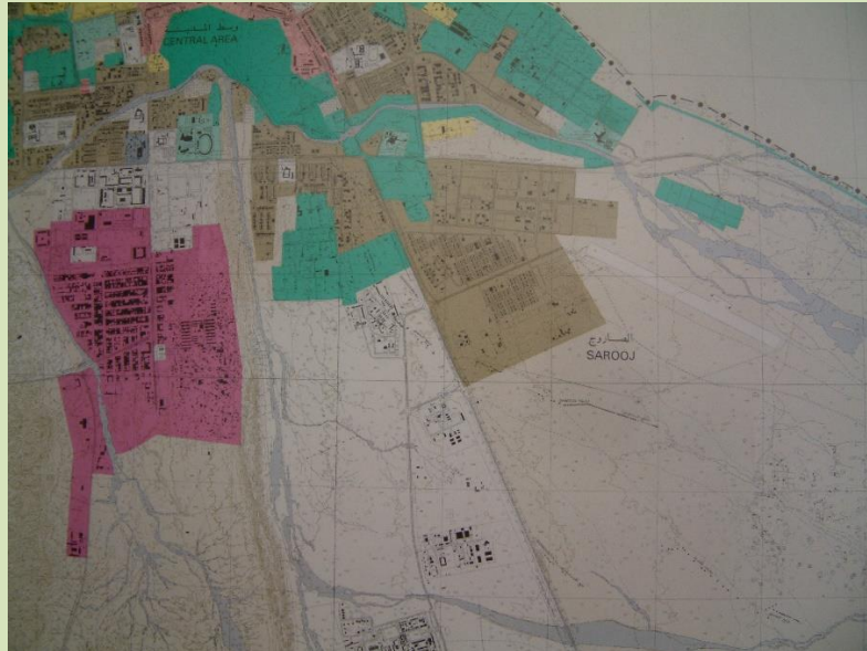
Figure 2: Al Ain city planning map showing the site of Dau'di airport at Sarooj

Dau'di is still visible in the Sarooj district just south of the former Intercontinental Hotel, now the Danat Resort on the Al Ain planning map some twenty years later (Figure 2). The new airport is also shown to the west.