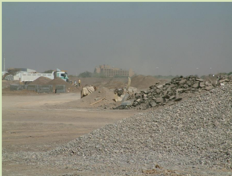
Photo 2: Demolition work at Dau'di in 2009, with the Intercontinental Hotel in the background

The short distance from the former Intercontinental Hotel is easily judged from Photo 2.