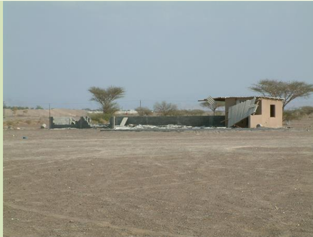
Photo 3: The remains of the last airport buildings at Dau'di in 2006