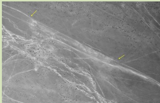
Photo 1: A 1968 aerial photograph of Dau’di airfield. The runway can be seen running from top left to bottom right and the arrows that marked the threshold at each end are just visible (indicated by yellow arrows). It is difficult to imagine that this is now just south of the Al Ain Danat Resort Hotel!

Aerial photographs from 1968 (Photo 1) show the runways at Dau’di and Hamasa, made of hardened sand and gravel, and marked with simple white stones along the edges.