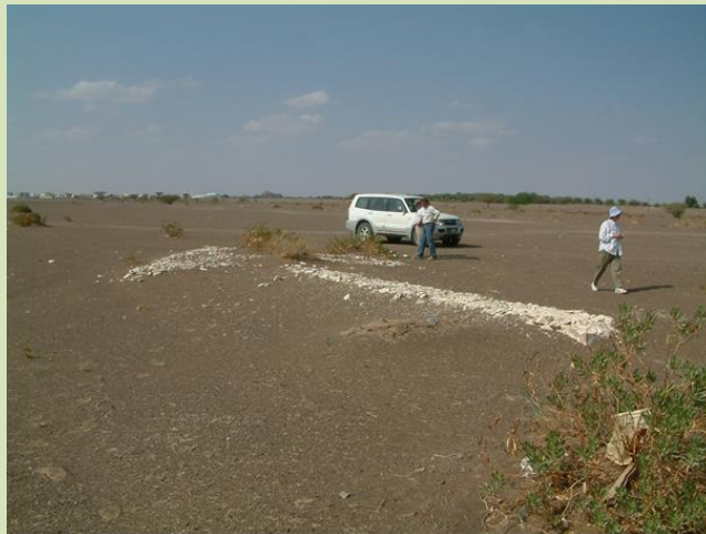
Photo 4: The eastern arrow, made of whitewashed stones, which marked the end of the runway at Dau'di, 2006

Dau'di was used for military and civil flights. The famous nurse of the Oasis Hospital, Gertrude Dyck (affectionately known as Doctora Latifa), shows a photograph in her book "The Oasis" (Motive Publishing, 1995) of a Twin Pioneer. The small twin-engine transport aircraft of the Royal Air Force (RAF) was on a medical evacuation flight about to leave Dau'di for Dubai in 1964 (Photo 5).