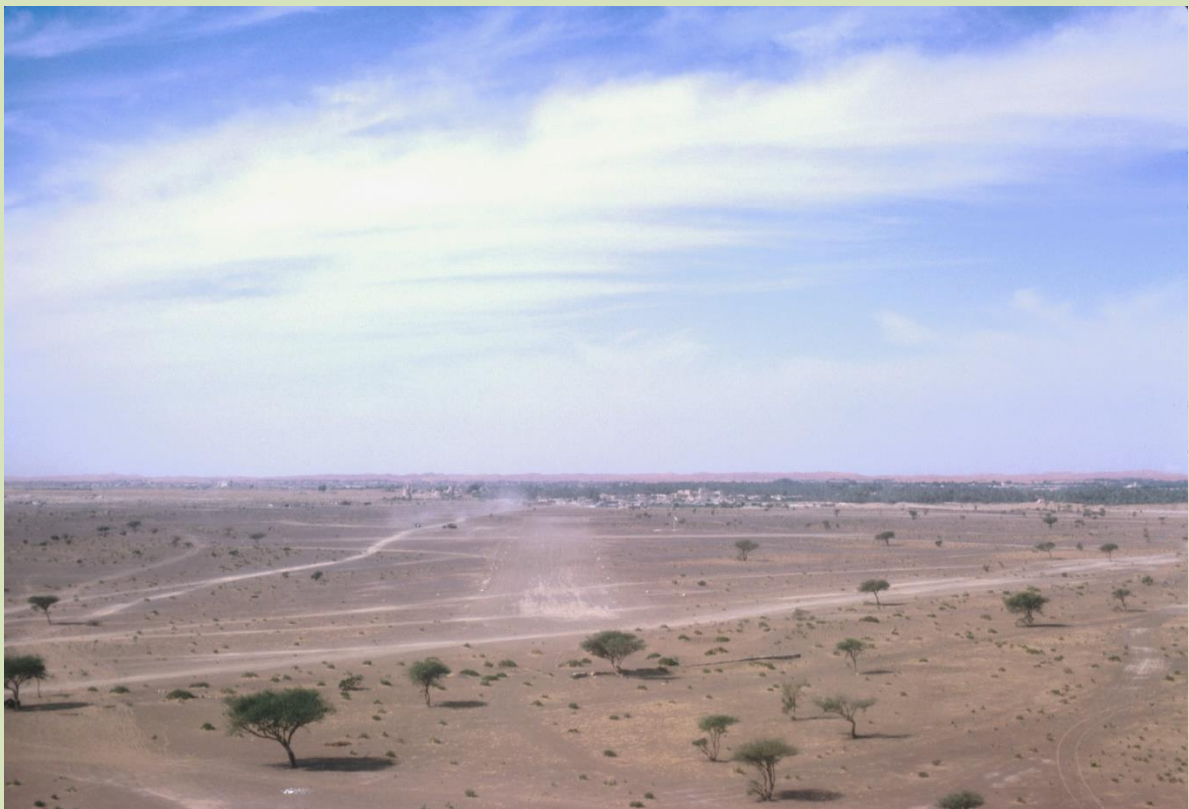
Photo 8: From the cockpit of an Oman Air Force Skyvan light transport landing at Buraimi-Hamasa in 1973. The two runways are visible, as is the town in the distance with its forts

Hamasa is inside the military compound east of the Buraimi souk and fort. It is best recognized by the presence of a large modern fort. It was used in parallel with Dau'di, but by the Oman Air Force and Police Air Wing, using small transport aircraft, such as the Skyvan (Photo 8).