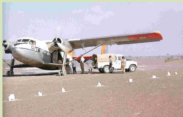
Photo 5: A medevac flight from Dau'di by Twin Pioneer.

Dau'di was used for military and civil flights. The famous nurse of the Oasis Hospital, Gertrude Dyck (affectionately known as Doctora Latifa), shows a photograph in her book "The Oasis" (Motive Publishing, 1995) of a Twin Pioneer. The small twin-engine transport aircraft of the Royal Air Force (RAF) was on a medical evacuation flight about to leave Dau'di for Dubai in 1964 (Photo 5).