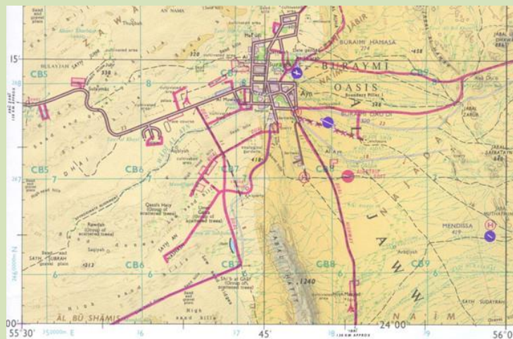
Figure 1: A 1975 Ordnance survey map showing Buraimi’s two airfields, Hamasa and Dau’di (indicated by blue circles)

Two large white arrows are clearly visible at Dau’di at each end of the runway, which ran east to west. Google Earth still has archived images of Dau’di taken before its final destruction in which the runway, its whitewashed marker stones and one of the arrows can be seen. Both airfields are indicated on the 1975 Ordnance Survey Map (Figure 1).