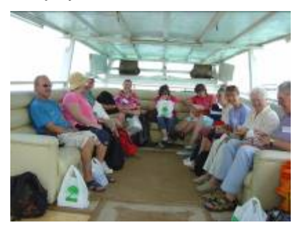
On the dhow

We arrived back at the hotel at midday in time for the next adventure – the Dhow trip around the mangroves. We embarked at the fish suq and spent a couple of hours cruising around the creek area in a small dhow. We saw a few herons, many seagulls and lots and lots of large blue jellyfish. Nice!