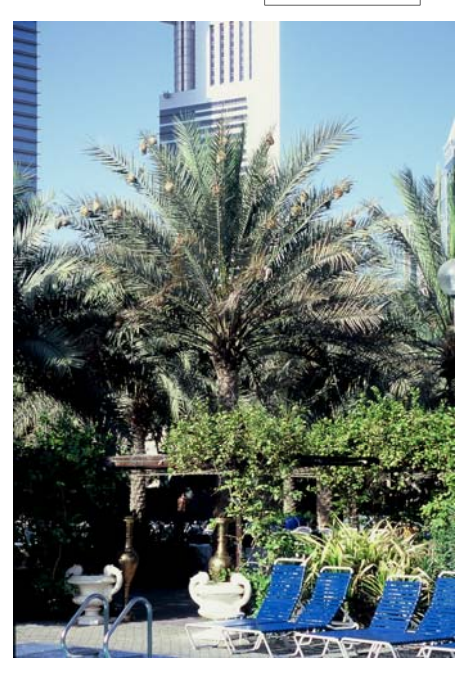
The club before demolition, a weaver nesting site

I was lounging by the pool at my apartments club, the mid-February sun helping me to recover from a cold made worse by an ambitious hike. As I was dressing to leave, another patron put aside nearby a small serving tray with the remains of coffee service: pitcher, milk, cups, sugar – and, on a saucer, a butter cookie that had gone uneaten.