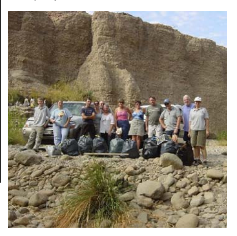
DNHG members with the large amount of rubbish they collected from Wadi Wurayah, during a trip there in December 2005

All of these areas except Wadi Wurayah have already been modified to a significant extent by human activity, and the reserve initiatives will have to accommodate continuing development of one sort or another in the immediately adjacent areas. In the case of Wadi Wurayah it is hoped that the proposal will spare this typical East Coast wadi from 'development', almost uniquely.