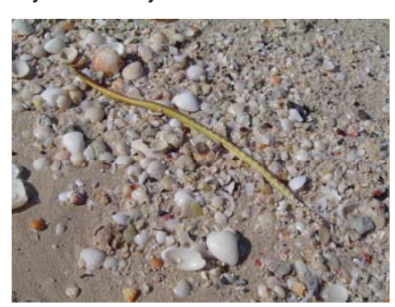
Sea snake on Jumeira beach

January, after a big storm, they found this sea snake on Jumeirah beach. Scanning The Emirates: A Natural History, it seems that it may be the viperine sea snake ( Praescutata viperina ) which has a somewhat similar description. Perhaps one of our readers can identify it correctly.