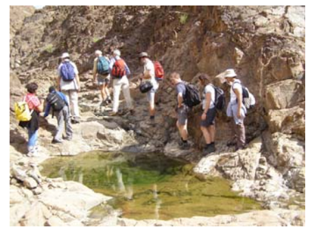
Hikers in the wadi

This winter's rain had obviously raised the hopes of local farmers and the two small fields where we have parked our vehicles in previous years were now fenced and planted with squash, tomatoes, etc. One happy farmer was on hand to wish us well and took particular note of our large and multi-national group, including a couple of youngsters (shabab).