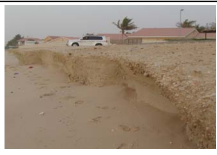
Jumeira beach in the February storm

On 1st February, they returned to the beach during the storm and found that quite a bit of the sand had gone.