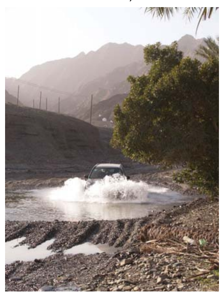
Flooded access roads

The DNHG's wadi hike in the Masafi area in early February was a rare experience due to the presence of flowing water along much of the route. This also made for precarious passages in a few places – rock hopping, cliff hugging and, for a few, plain old splashing through, which were not part of the trip advertisement (neither were the flooded access roads).