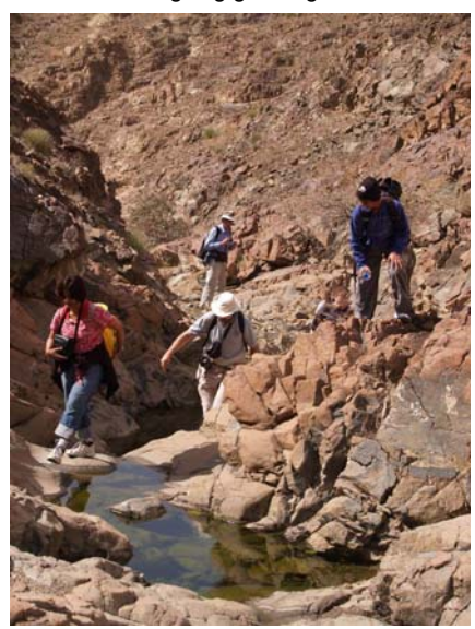
... and rougher

In contrast to our last visit, we saw no snakes, vipers or otherwise. This could have been due to the lower temperatures, but there is reason to fear that it may be due to the development of a local camp far up the wadi; the laborers in charge would probably not tolerate poisonous snakes along their commute.