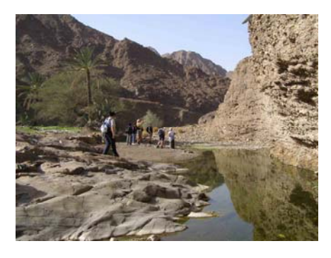
The lower part of the wadi

The sound of flowing water made us all feel cooler, in case the lingering northerly breezes of the shamal weekend did not.