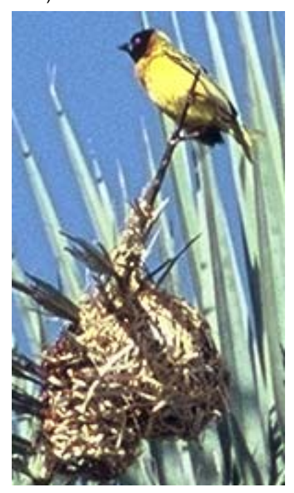
Male lesser masked weaver

So: the lesser masked weaver dominated all; the palm dove dominated the house sparrow, but somewhat in the way that a bull dominates a matador (the sparrow moving in for the "kill" when the opportunity was right); and the red-vented bulbul, despite initial interest, did not join in the contest (Why not? Temperament? Not as comfortable on the ground? No sweet tooth?).