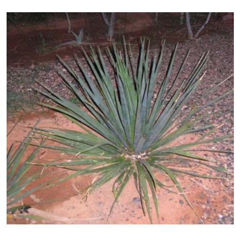
Propagated dragonblood tree

Day two took us south, straight across the mountains, through wadis and over mountaintops. The scenery was stunning. We saw a