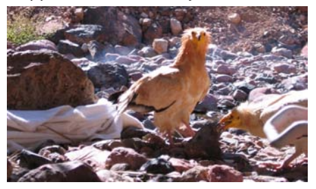
The Egyptian vultures were not shy

Mariicke Jonabloed described one of the memorable moments of the day when we stopped at Wadi Di Ehro where we swam and had a picnic lunch. "The going was all but easy and it took all my concentration to pick my slow way across the rocks to the pool, where the swimming, in crystal clear water, was great! During the picnic (barbecued goat) we were besieged by Egyptian vultures, who behaved like chickens. Soon Salman, our oldest participant, was feeding them by hand. One Egyptian vulture, who was scrounging around behind my back wanted to join the feeding but misjudged its take-off and whacked me on the head with its wing. I ask you, has any of you ever been clipped on the head by a vulture?"