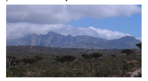
Dragonblood trees on Diksam plain

that oozes out when the bark of the trunk is scratched. We stopped many times on the way to admire the amazing forever-changing land-scape. Socotra has many caves and we drove up to Di Gub cave to see inside and look at the formation. This cave, like most caves, is used by the people and goats especially during the rainy season and traces, such as goat wool and droppings, as well as pens were clearly visible.