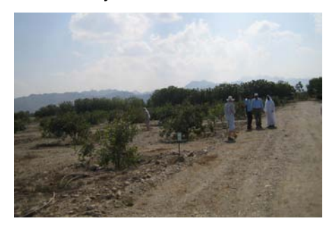
In the orchards

In the fruit section there were a great many different varieties such as pommelos, oranges, lemons and mangoes, many of which were weighed down with ripened and ripening fruit. It was explained that unwanted fruits were then sold on to the local community to eliminate any unnecessary wastage. We were also encouraged to taste them. They were delicious!