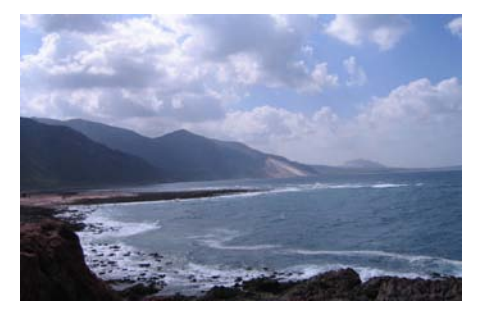
View from Ras Dihamri

On the way back, we stopped at a nursery dedicated to protecting and growing indigenous flora to ensure the sustainability on the island. It was interesting to see the variety of plants and the minute size of baby Dragon Blood trees, considering their size on Diksam plain. Night fell suddenly and we returned to the hotel in the dark.