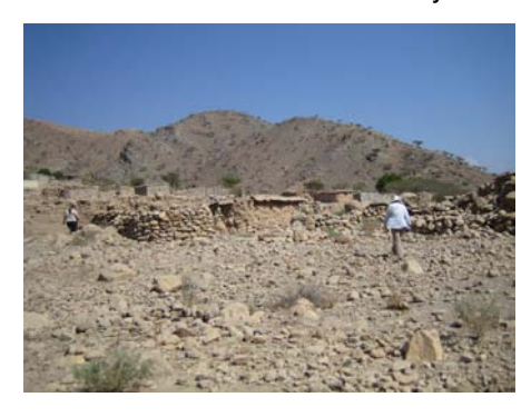
The village of Wamm

Later, many of us visited the village of Wamm with traditional stone houses and a watch tower, only a short distance from the Nursery.