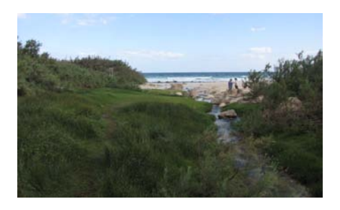
Foliage protecting the stream

series of caves and grottos directly above. The water bubbled out from the sand and created a small fresh water stream that gave life to a beautiful landscape created by five plant species. Tamarix created the boundary and protection to the stream, which had large areas with bermuda grass, lipia nodiflora, junctus (a smaller species than normal) and exium with its beautiful light sapphire blue star-shaped flowers. It was an idyllic setting and a great way to wash off after our ocean dip. The tamarix was the healthiest I had ever seen with foliage so dense that it looked like Thuya. This is indeed a unique setting and typified the many and various habitats of the island. Because of its uniqueness it should be protected but could be damaged by an overload of tourist camping in the site." (End of Part 2)