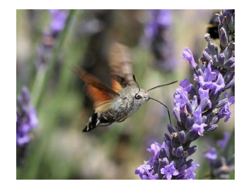
Macroglossum stellatarum Hummingbird Hawkmoth

This pleasant pastime was short-lived, however, and was rudely interrupted, since we were not alone in having noticed the hawkmoth. Before our eyes, it was taken by an equally observant Hume's wheatear, a year-round mountain resident.