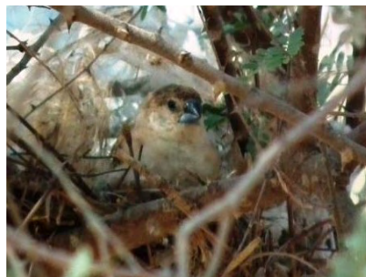
Photo: Indian Silverbills at their nest in Mushrif Park (by Binish Roobas)

A visit to Mushrif National Park, along the Khawanej Road, always results in a surprise or two. On an early December visit, we came upon a pair of Indian Silverbills building their nest. It was obvious that one bird was collecting nesting material - bits of feather, paper napkin and even a strip of bark.