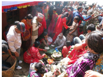
Nepal hill temple ceremony