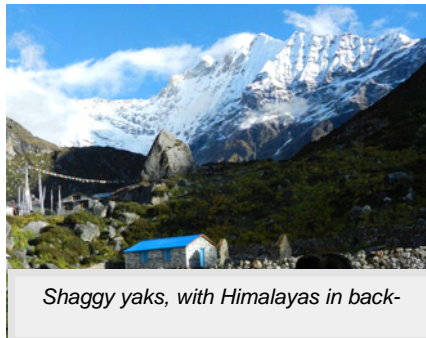
Shaggy yaks, with Himalayas in back-

The next day saw part of the group stop at Langtang Village (3541 metres) with the rest continuing on to Kyanjing Gumpa (3900 metres).