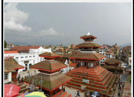
Kathmandu