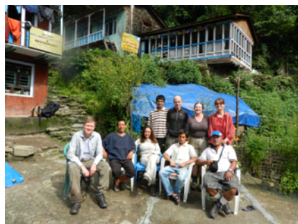
The group with porters and Sherpa

Rowland: A long trip back: To avoid landslides, we take another most amazing, scenic route through the mountains with steep climbs followed by a precipitous descent to Syabrubesi.