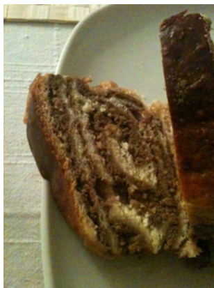
Slovenian Potica cake

It will be a full day trip (camping overnight is also an option). If interested contact Sonja Lavrenčič on sonja@publicisgraphi.cs.ae for more information.