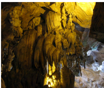
Limestone caves.

Engineer Louisa Akerina, adventurous as ever, is now in Lumut in Malaysia, west of the Cameron Highlands and about three/four hours north of Kuala Lumpur.