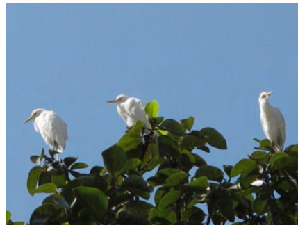
Cattle Egrets perched in a large tree

Cattle Egrets are among the world's most widely distributed birds. They are named for their tendency to follow livestock around in grassy environments, feeding on insects flushed by the grazers. Dubai bird-watchers know that they also follow pivot irrigation systems and I have seen them follow human beings who were cutting rice in paddies. Although originating in the Old World, they are now found in Central and South America and have even been reported from South Georgia, on the edge of the Antarctic Ocean.