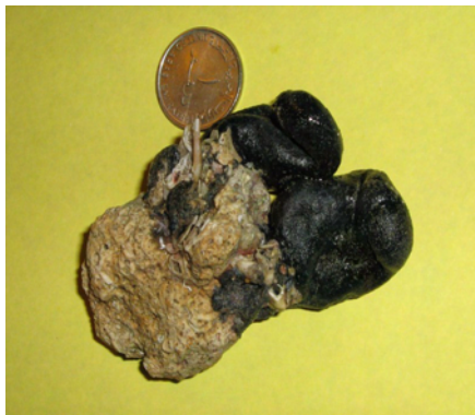
"Boxing glove" blebs attached to beach rock.

Walking on Rams beach (north of RAK) after an October storm, Barbara Couldrey, who has an eye for what is out-of-the-ordinary, found an accumulation of little black blebs, like miniature boxing gloves, attached to small pieces of coral and cemented sediment thrown up by the waves.