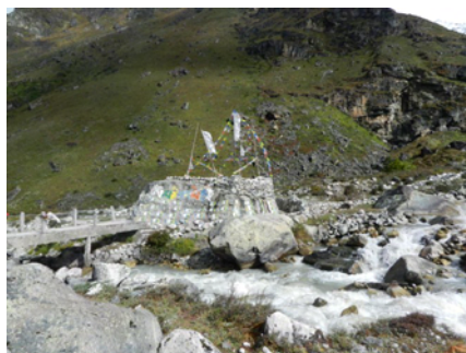
Temple on the River

The highest peak in the area is Langtang Lirung, 7227m.