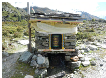
Praying Mill.

Contributions to the Gazelle from old and new members alike are welcomed. Short pieces of 100-500 words are ideal as this allows publication of more pieces.