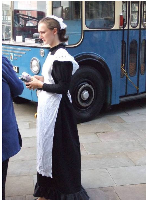
One of Bradford Heritage day activities: a young lady dressed in traditional costume.