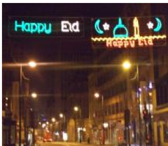
Happy Eid sign and Islamic decorations over Bridge Street in Bradford city centre.