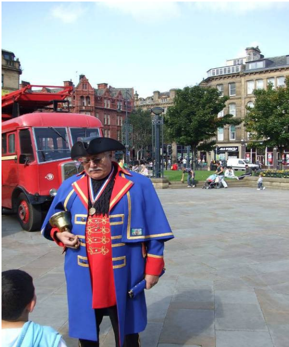
A man dressed in traditional costume during Bradford's Heritage Day. The Town Crier – responsible for making public announcements -- has a loud and strong voice.

This reflects part of this great city's past and present coming together, combining to reflect Bradford's rich heritage and cultural life.