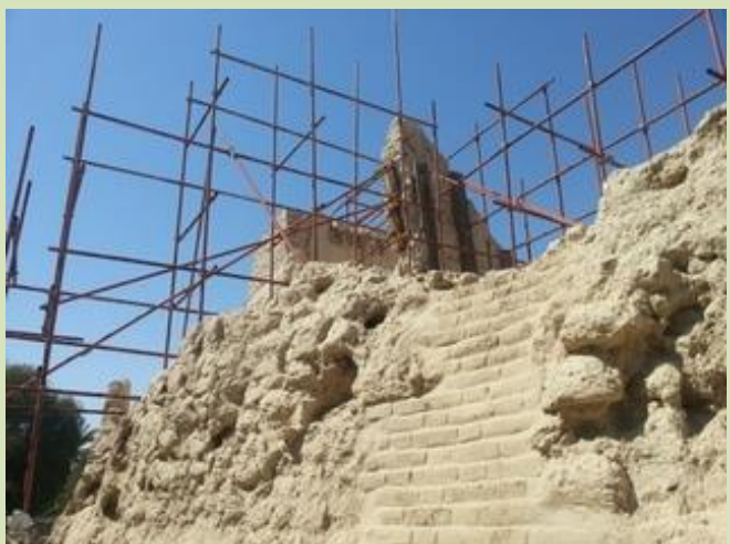
Hili Oasis Restoration Scaffolding