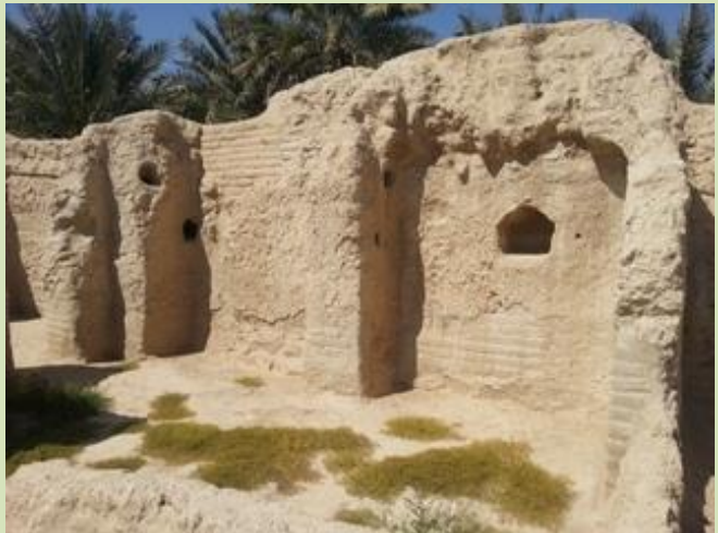
Hili Oasis Historic Buildings