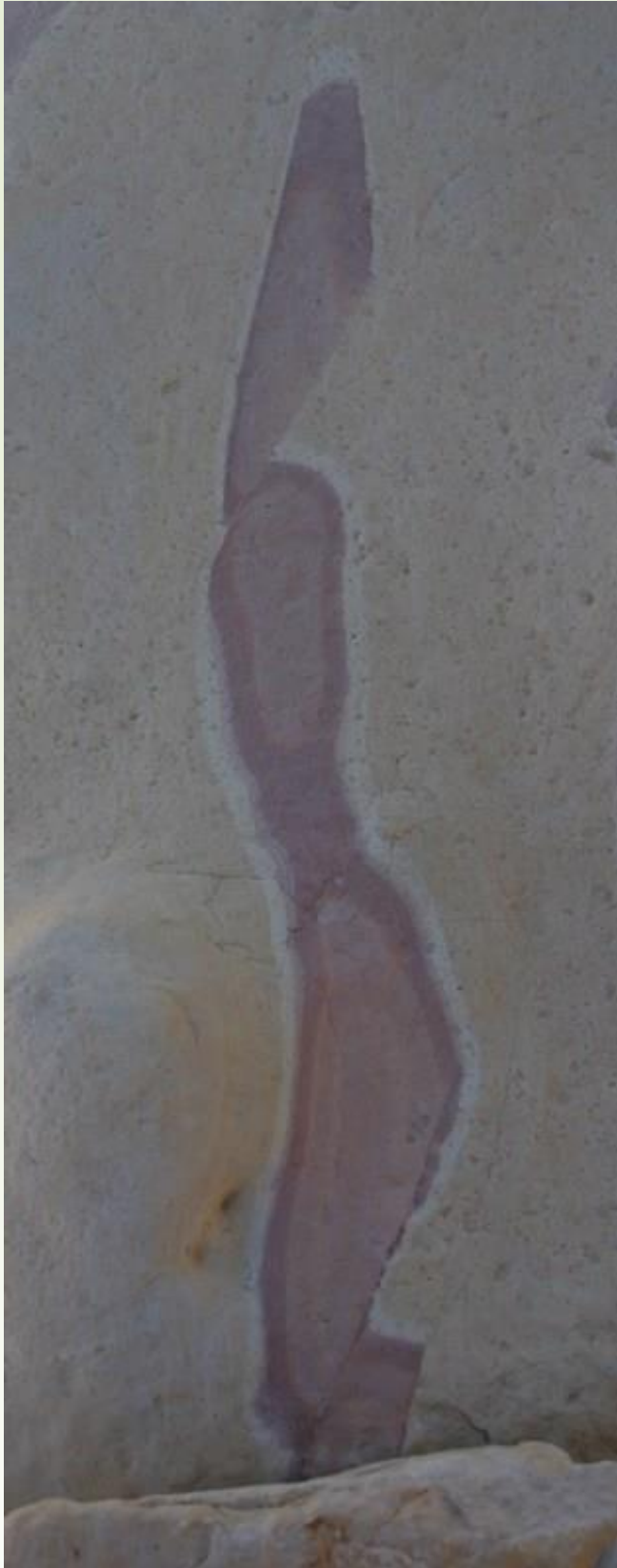
Wadi Nahyan Rock Art