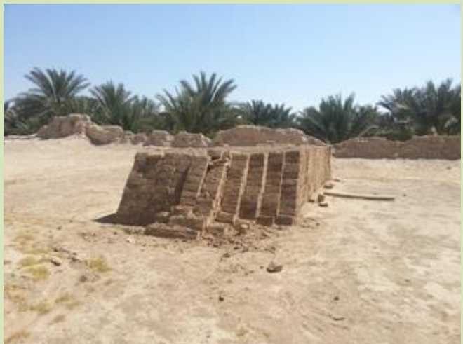
Hili Oasis Mud Bricks for Restoration