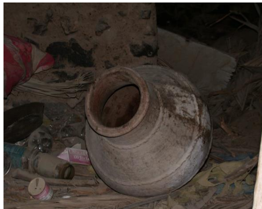
The Pot in Situ

After several years of enjoying the pots -- and after Jazira became a popular weekend destination -- the two pots in the shed disappeared and the shed was removed. The third pot (our date storage pot) was still hidden in the storage room.