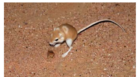
The gerbil with his bread