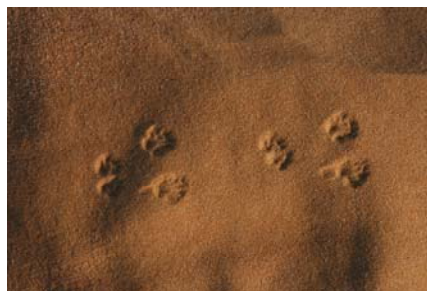
Gerbil tracks on the dune

Next morning we realized that he was still with us when we counted more than 40 tracks over the sand dune separating our camp from his, and some in every corner of our camp.