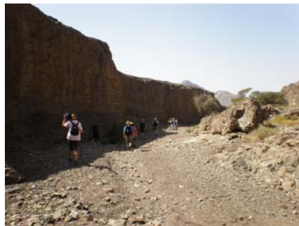
Donkey Fox Wadi