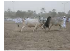
Bull pushing, Fujeirah

On the evening of Friday 27 th we will be holding the Inter-Emirates photographic competition. The format of this is changed. Please see page 1 for all the details you'll need.