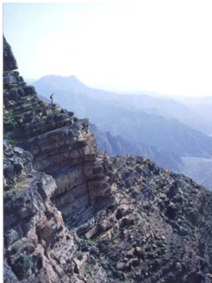
Rock bands on the way up to Yabana ridge

"We didn't have our headlamps with us as an earlyish descent was planned – but that is no excuse! However, we had a very small moon and from past experience, unless it is an absolutely black night, it is better to use nature's illumination – we could see perfectly well and I only stumbled once.