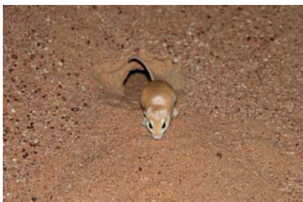
The gerbil by his burrow