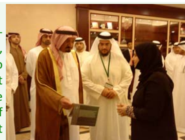
HH Sheikh Humaid bin Rashid al-Nuaimi, Member of Supreme Council and Ruler of Ajman listens to a brief from the Chair-

EEG participated in this Conference, which held under the Patronage of HH The Ruler of Ajman, co-organized by Ajman Municipality and Planning Department and Ajman University of Science and Technology on 30-31 January. The conference represents a scientific gathering of Arab and Western experts to discuss modern ways and means of achieving sustainable development through green environment in the Emirate of Ajman as a model in the United Arab Emirates and the Gulf region.