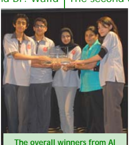
Salam Private School

plausible solutions that can be used by each and every one of us in our daily lives. EEG was partnered by Al Safi Club for Friends of the Environment and was also supported by Dubai International Academic City and Tamani Hotel Marina to conduct this event.