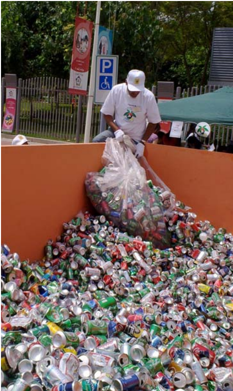
EEG collects record amount of cans from the May Can Collection Drive. More on Page 3