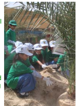
Children at Jumeira Model School planting trees

On a separate occasion Zahra Al Marashi planted 8 date palm trees in her garden and dedicated them towards the "Million Tree Campaign". It is a pleasure to announce that under the Million Tree campaign, EEG has planted or facilitated the planting of more than 1,615,110 indigenous trees in the UAE to date. EEG pledges to continue this project as an ongoing commitment to UNEP "Plant for the Planet, Billion Tree Campaign".