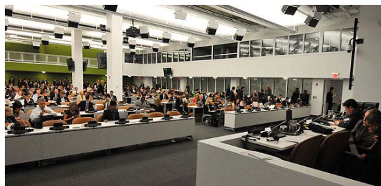
Delegates attend a plenary session of PrepCom 1 at UN Headquarters in the temporary ECOSOC chamber (the regular ECOSOC chamber is currently being refurbished).

There were some discussions on whether the term 'green economy' should continue to be used or whether 'sustainable development' is a better fitting term; the discussions continued but it was noted that economic changes may be the 'magic bullet' in helping to solve the current global issues. All participants agreed that discussions can not wait until 2012 and the time for momentum is now. As the planning and discussions begin for Rio+20, EEG will be keeping up to date with the latest developments and meetings, and hopefully big actions will result to create a sustainable future for everyone.