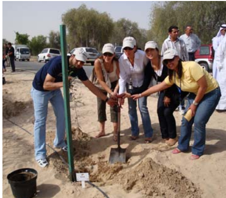
EEG Continue to 'Plant for the Planet' under the 2nd phase of MyTreeInDubai.com and the Million Tree Campaign