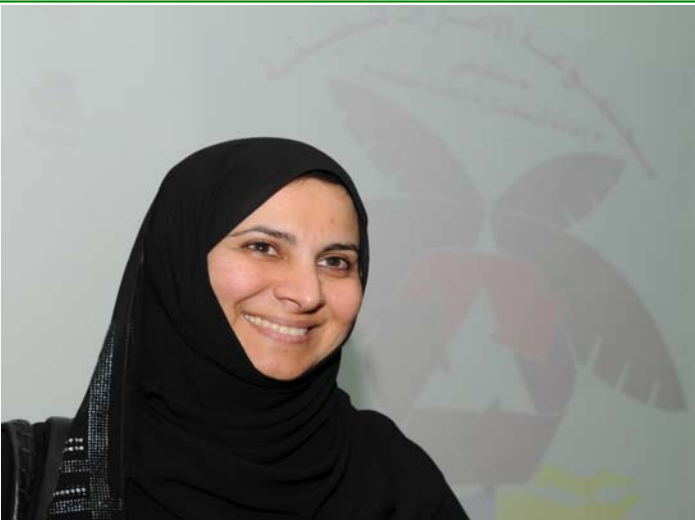
EEG's Chairperson and UN Global Compact Board Member