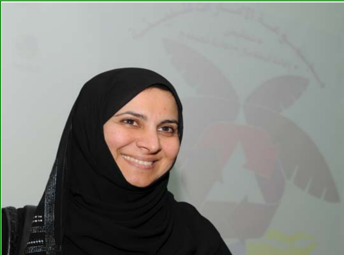
EEG's Chairperson and UN Global Compact Board Member