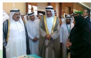
H.H Sheikh Hamdan Bin Rashid Al Maktoum listening to explanation about EEG from the Chairperson during the event

EEG participated in the EnviroCities 2010 Conference and Exhibition, which was organized under the patronage of H.H Sheikh Hamdan Bin Rashid Al Maktoum, Deputy Ruler of Dubai, Minister of Finance, and Chairman of Dubai Municipality. The event, developed by the Environmental Center for Arab Towns was held on the 28 th and 29 th of November at the Inter Continental Hotel, Dubai. The conference covered a number of urban sustainable living topics such as green future cities, green building codes, green hotels, green transports and the like.