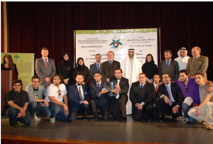
The overall winners of EEG's 10th Inter College Environmental Public Speaking Competition, College of Business Administration, Prince Sultan University, KSA with the judges and sponsors.

Gear UP and join the "Clean UP UAE 2010" 12 December 2010 across 7 emirates in the UAE!